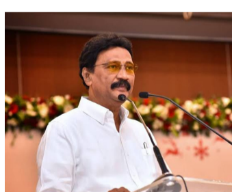
Vijayawada, June 22