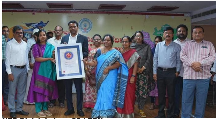
NTR District, June 22 | TPN Bureau