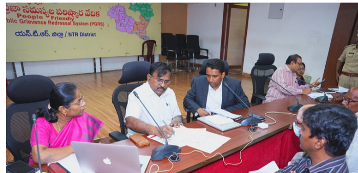
Vijayawada, June 22