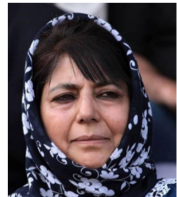
engagement with New Delhi.

She also noted that previous political divisions and rivalries had weakened collective efforts to address Jammu and Kashmir's concerns. Drawing a parallel with Ladakh's united approach, Mufti argued that a similar consensus-driven strategy could help advance the region's aspirations and strengthen its