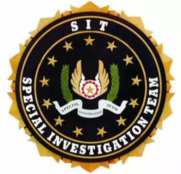
Special Investigation Team

Meanwhile, police urged social media users to exercise caution while sharing unverified information online and warned that circulating false or misleading content could attract legal consequences under relevant laws.