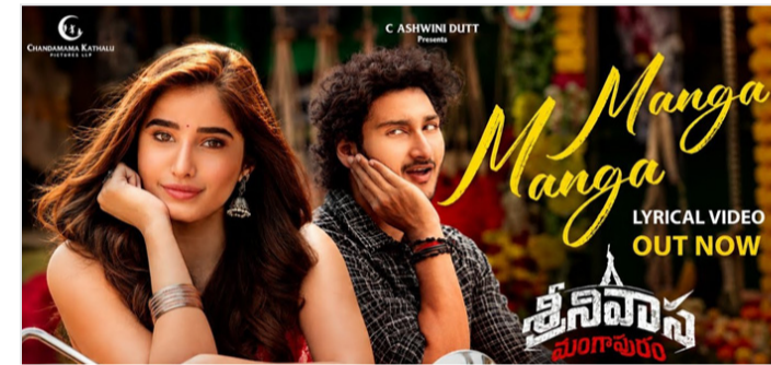
The song has also attracted attention because of its catchy lyrics written by Kasarla Shyam. Combined with GV Prakash Kumar's upbeat music, the track has become a favourite among younger audiences within a short time of release.

Apart from the lead pair, the film also features veteran actor Mohan Babu in a key role.