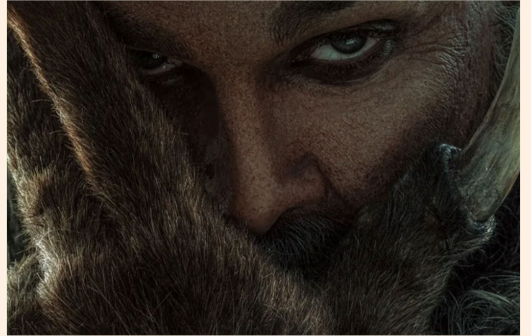
As films increasingly rely on viral trends for promotion, balancing fan engagement with commercial rights may become one of the biggest challenges for the entertainment industry in the coming years.

Many industry observers believe this could become a turning point for how Indian filmmakers approach marketing and content ownership in the social media era. As films increasingly rely on viral trends for promotion, balancing fan engagement with commercial rights may become one of the biggest challenges for the entertainment industry in the coming years.