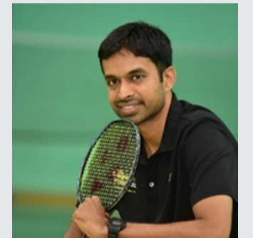
Pullela Gopichand Chief national coach The Indian national badminton team

gether, they provide India with a powerful foundation to transform its sporting aspirations into sustained Olympic success.