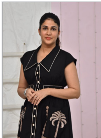
The actress revealed that she had already watched the film and was pleased with its output. "It has come out really