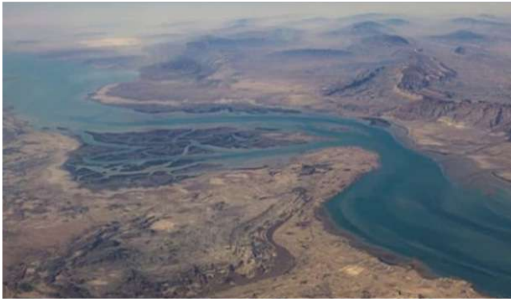
across major economies. Under normal conditions, around 150 vessels pass through the strait every day.

The possible reopening of the Strait of Hormuz may appear to be a major breakthrough in easing the global oil and liquefied natural gas (LNG) crisis. However, experts warn that even if the critical shipping route resumes operations immediately, global energy markets will not recover overnight. Instead, it may take months—possibly until July—for oil flows and supply chains to return to normal levels.