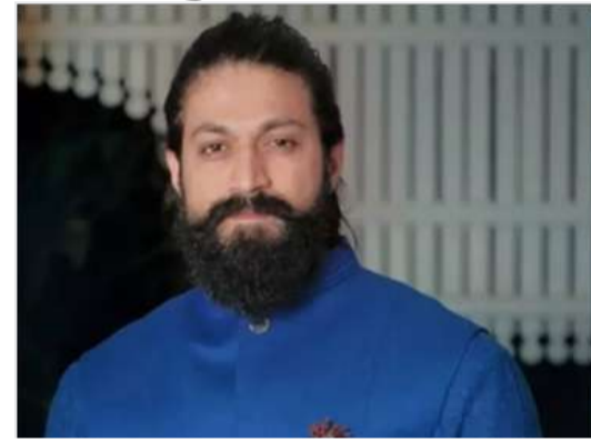
and religious sentiments.

Yash's comments, however, did not go unnoticed and sparked debate among audiences. Some sections expressed discomfort with presenting Ravana in a sympathetic or layered manner. For many, Ramayana is not just a story but a sacred epic symbolizing the battle between good and evil, where Lord Rama represents righteousness and Ravana represents evil. Critics argued that Ravana's actions, including the abduction of Sita, cannot be justified and warned that portraying him as an anti-hero or glorifying his personality might send the wrong message. These reactions fueled discussions on social media, with people debating the balance between creative freedom