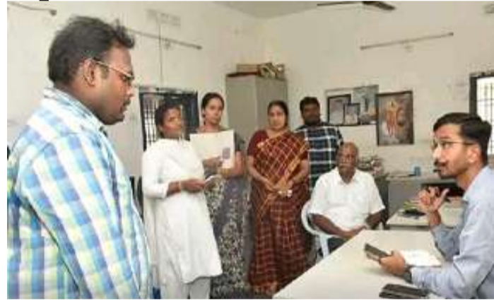
employee could report to duty without maintaining proper discipline and office decorum. He questioned how a government employee could report to duty without maintaining proper

During a surprise inspection of the 5th ward secretariat in Bapatla town on Thursday, the Collector observed the employee in inappropriate attire and expressed strong dissatisfaction over the lack of basic discipline and office decorum. He questioned how a government employee could report to duty without maintaining proper