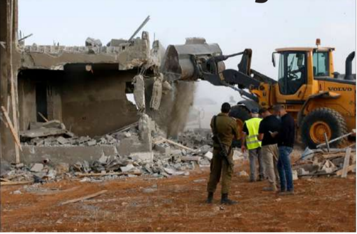
Gaza. A combat soldier quoted in the report said there was even a list of homes marked for demolition, and progress was being measured based on the number of buildings destroyed each day. The comments suggest a systematic ap-

According to reports citing Israeli soldiers, bulldozers have been used to raze villages near the Israel-Lebanon border fence. The cleared land is being used to build new military outposts, which some soldiers believe are intended to be permanent structures. One official reportedly described the approach as similar to operations previously carried out in