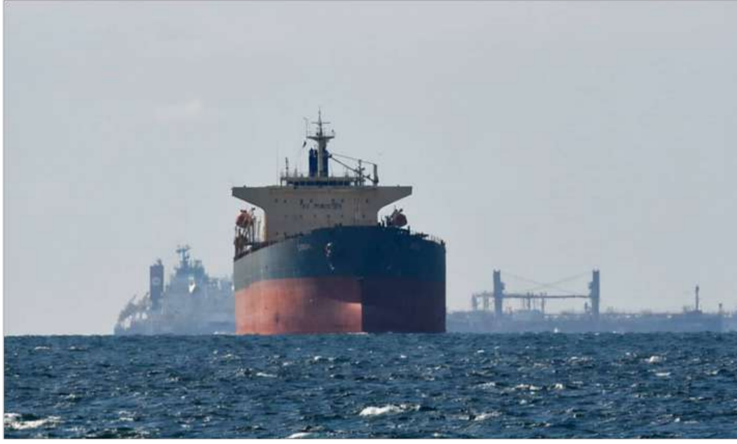
US sanctions and restrictions. The supertanker, capable of carrying up to two million barrels

According to Iranian officials, a very large crude carrier (VLCC) that had been blacklisted by the United States sailed through the Strait of Hormuz and reached Iranian waters without any interference. The claim was made by Iran's Consulate General in Mumbai, which stated that the vessel completed its journey openly with its tracking system switched on, challenging