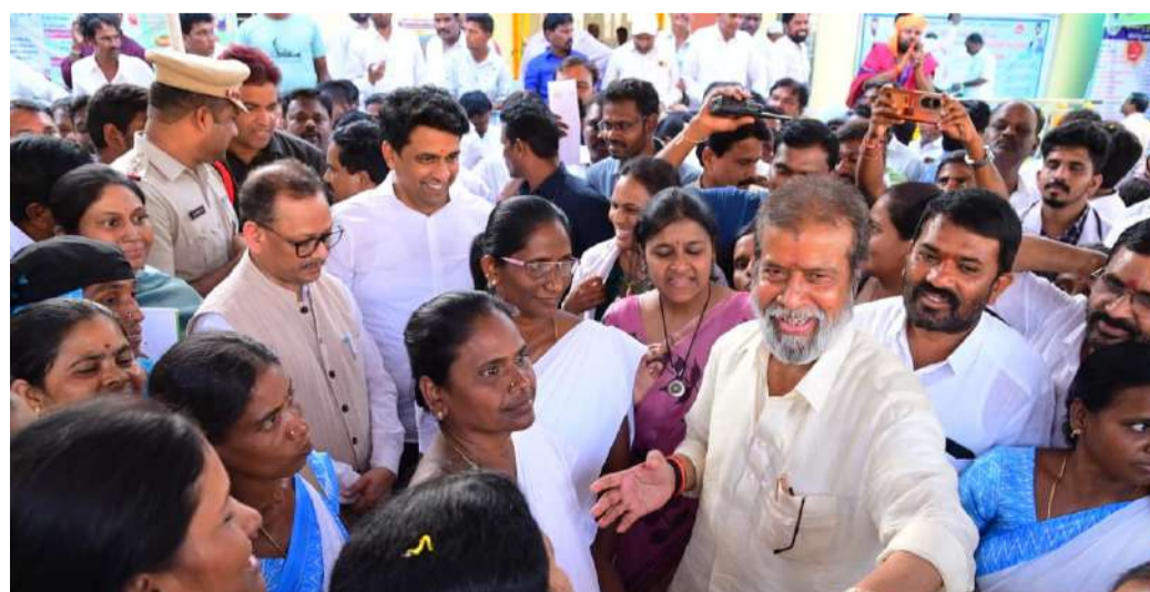
Osmania Medical College.

He said efforts are underway to expand postgraduate (PG) medical seats and add 14 new departments to the existing 21 departments in the medical college, taking the total academic strength to a higher level. The institution, he said, will be developed on the lines of