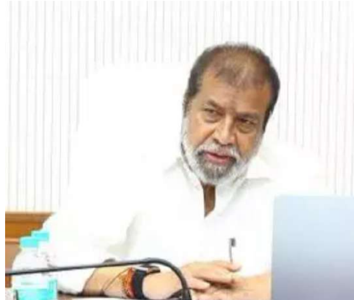
calendar has created uncertainty among aspiring medical professionals. Many qualified candidates are left waiting for long periods without clarity on

The association pointed out that the lack of a structured and time-bound recruitment