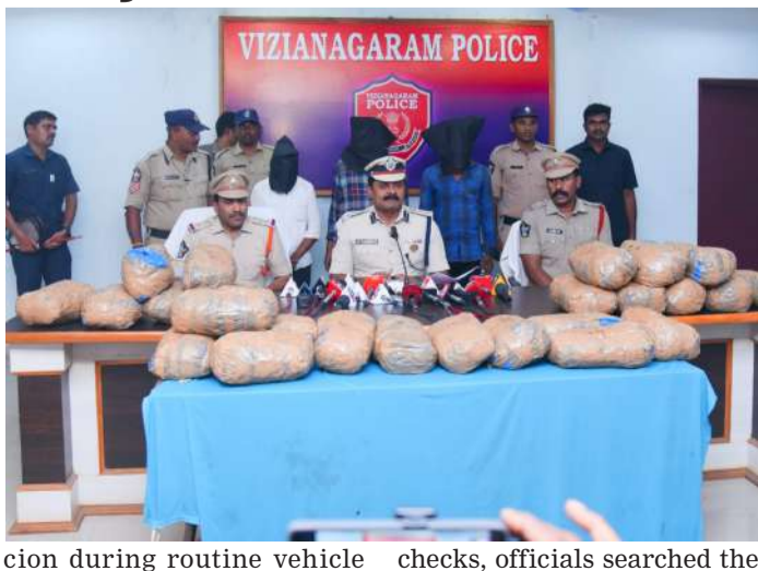
dicion during routine vehicle checks, officials searched the