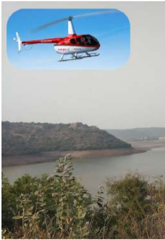
ural beauty, is expected to attract nature lovers and pilgrims alike.

According to the plan, the helicopter service will operate from Hyderabad and pass through Somashila before reaching Srisailem. Tourists will first land at Somashila, where they can explore the serene surroundings and enjoy boating in the Krishna River. The location, known for its peaceful environment and nat-