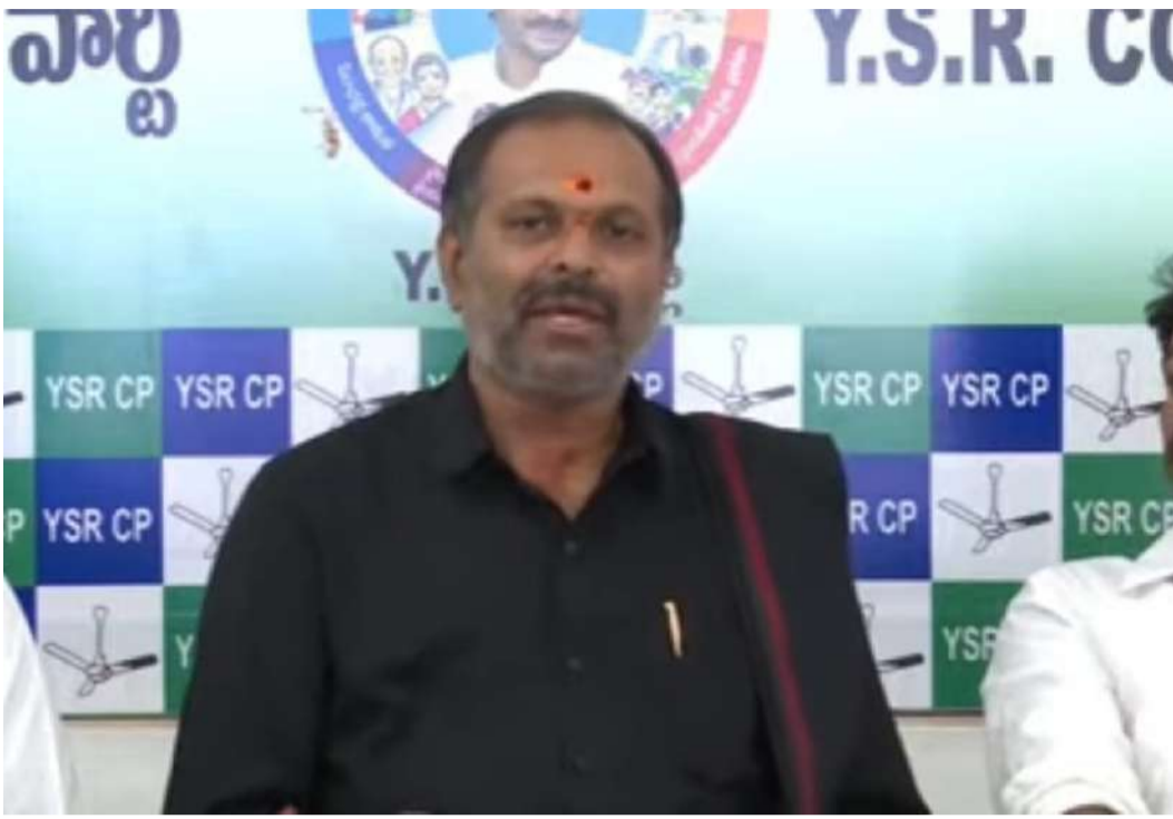
YSRCP leader accused Chandrababu Naidu of encouraging divisive politics by fueling caste and regional tensions for political gains.

The YSRCP leader accused Chandrababu Naidu of encouraging divisive politics by fueling caste and regional tensions for political gains. Referring to remarks made in the Rajya Sabha by Renuka Chowdhury, he claimed they were made at the behest of the TDP leadership, and criticized coalition leaders for not condemning those statements.