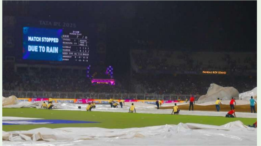
The KKR-PBKS no-result serves as a reminder of the unpredictable nature of cricket, where weather can play a decisive role in outcomes, and teams must be ready to adapt to unforeseen conditions to succeed in the league.

ened anticipation for future matches. Team management from both sides acknowledged the unusual circumstances and emphasized focusing on the next matches. KKR will look to strengthen their batting lineup, while PBKS will work on maintaining consistency in their bowling attack. With the IPL season in full swing, teams must adapt to challenging conditions, including unexpected rain interruptions, and strategize for upcoming fixtures. Despite the washout, the match highlighted the competitive spirit of both teams and kept fans engaged with the excitement of the tournament.