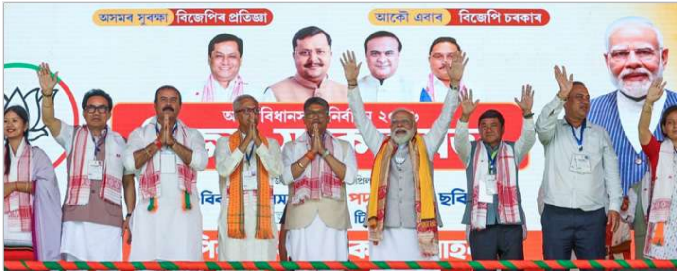
Congress leader Rahul Gandhi has also stepped up his campaign efforts, particularly in Kerala and Assam. He has targeted the ruling govern-

Meanwhile, political tensions in Assam have escalated with a war of words between the ruling BJP and the Congress. Chief Minister Himanta Biswa Sarma has accused opposition leaders of making false allegations, while the Congress has responded with counter-charges. The situation has added a layer of controversy to an already heated campaign atmosphere.