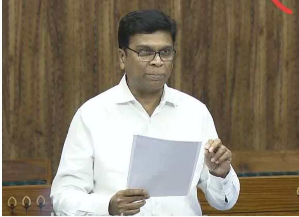
Chandrababu Naidu, is dedicated to improving educational infrastructure and ensuring equitable learning opportunities for all students in Andhra Pradesh.

ready been released. For 2025-26 (up to 30 January), 1,407.72 crore was approved, with 698.72 crore released so far. On average, the state has been receiving between 1,300 crore and 1,700 crore annually over the last three years. The PM-SRLM scheme, aimed at transforming selected schools into model institutions, has positioned Andhra Pradesh at the forefront nationally. For 2024-25, 469.43 crore was approved under this scheme, with 294.12 crore released. For 2025-26, 386.1 crore was sanctioned, with 44.39 crore disbursed so far. According to the central government data, a total of 39.43 lakh students are enrolled in government schools across Andhra Pradesh, of which 9.93 lakh (25%) are SC students. During 2024-25, 4,91,452 students enrolled in special model schools, including 1,52,133 SC students, highlighting the state's commitment to inclusive education. Prasad Rao reaffirmed that the coalition government, led by CM Nara