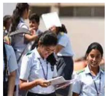
Intermediate Education Andhra Pradesh said all preparations have been completed for smooth and timely release of results across the state.

Extending his wishes to students, Lokesh said, "This is your moment—move forward and shine." Education officials stated that the initiative reflects the government's focus on digital governance and student-friendly services.