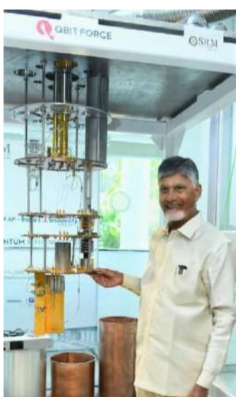
security skills in collaboration with IIT Madras, IBM, and other institutions.

The Chief Minister said the initiative will position Andhra Pradesh as a global hub for quantum research, innovation, and industrial applications.