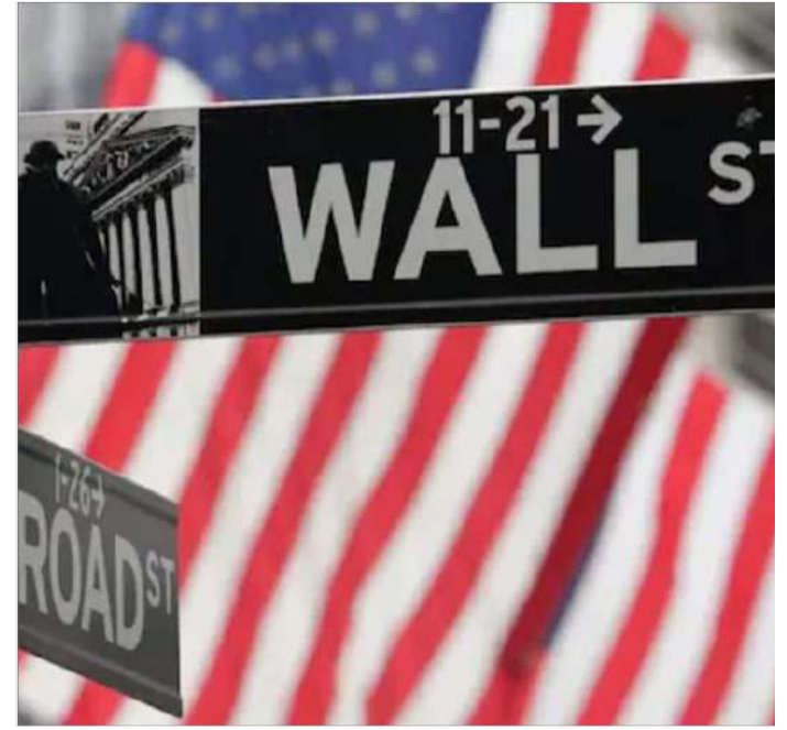
and supported global markets. The outcome of the second round of talks later this week is likely to play a crucial role in shaping market direction in the near term.

sentiment. Traders are also watching upcoming economic data releases and corporate earnings, which could further influence market direction. Despite these factors, geopolitical developments remain the primary driver for now, with investors awaiting clarity from the upcoming talks. Overall, the rise in Wall Street futures reflects cautious optimism among investors. While uncertainties remain, hopes of diplomatic progress between the United States and Iran have improved sentiment