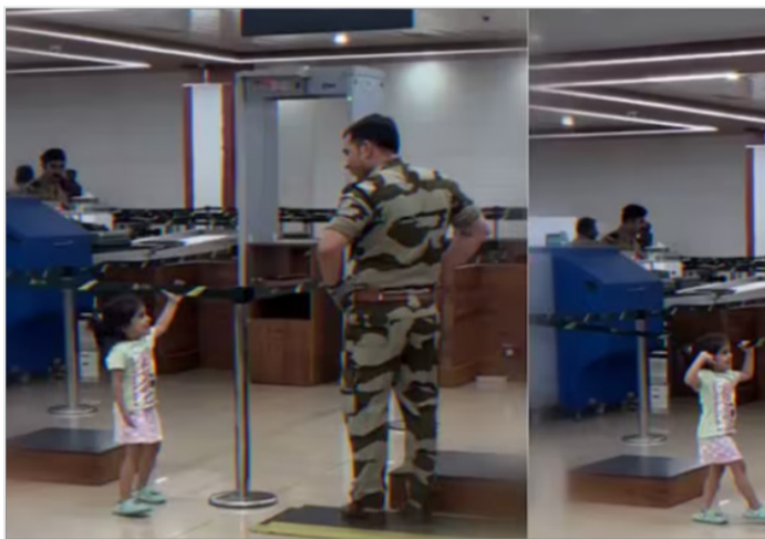
acts of gratitude.

A simple yet deeply touching moment at a public place has captured the attention of social media users across India. A video showing a young girl saluting Central Industrial Security Force (CISF) personnel has gone viral, earning widespread appreciation for its innocence, respect, and emotional impact. The clip shows the little girl standing confidently as CISF officers pass by in uniform. As they walk past, she suddenly raises her hand in a crisp salute. What makes the moment special is not just the gesture itself, but the sincerity behind it. The officers are visibly surprised, and one of them returns the salute with a warm smile, acknowledging the child's heartfelt respect. The interaction lasts only a few seconds, but it leaves a lasting impression. For many viewers, the video is a reminder that respect for those who serve the nation often begins at a young age, shaped by observation, admiration, and simple