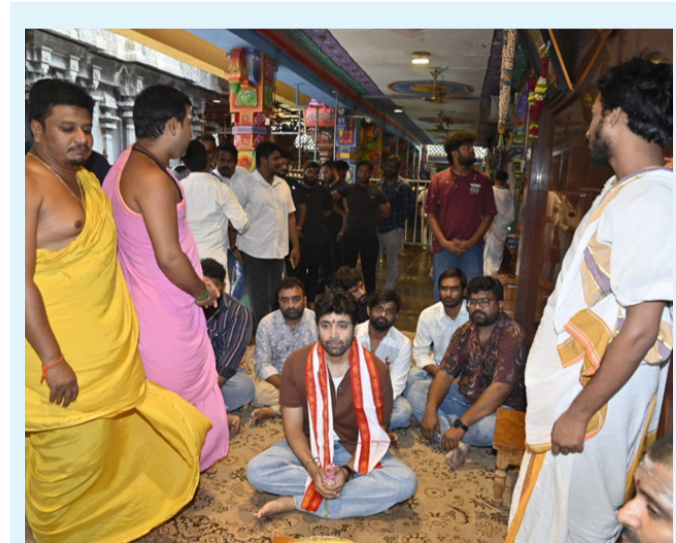
Actor Adivi Sesh is offering special prayers at the Goddess Durga temple after the global success of his film Decoit.