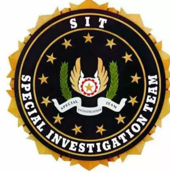
Special Investigation Team

The inquiry, being conducted at the high-security Command and Control Centre, is seen as a crucial step towards uncovering the full extent of the alleged surveillance network. With the probe intensifying, all eyes are now on the upcoming questioning, as Shivakumar's deposition may play a key role in identifying those responsible and advancing the investigation further.