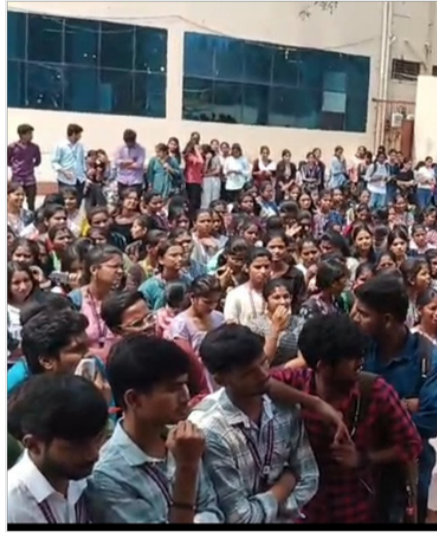
Hyderabad, April 25

Students in Maisammaguda staged a protest by boycotting engineering colleges under the leadership of the AkhilBharatiyaVidyaarthiParishad (ABVP), demanding the immediate release of pending scholarships and fee reimbursement dues.