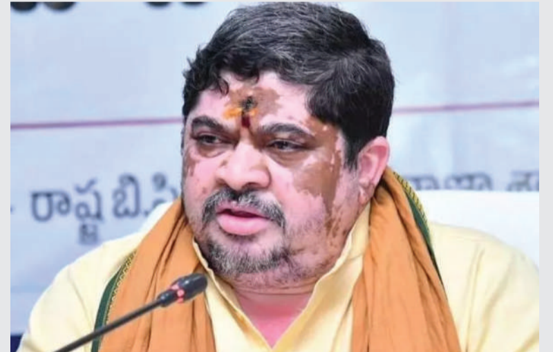
Siddipet, March 22