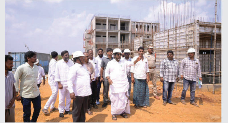
Madhira, March 22 | TPN Bureau

Deputy Chief Minister Bhatti Vikramarka has called for accelerated construction of the Integrated Residential School in Lakshmiapuram village, Bonakal mandal, emphasizing the government's commitment to high-quality education and modern infrastructure.