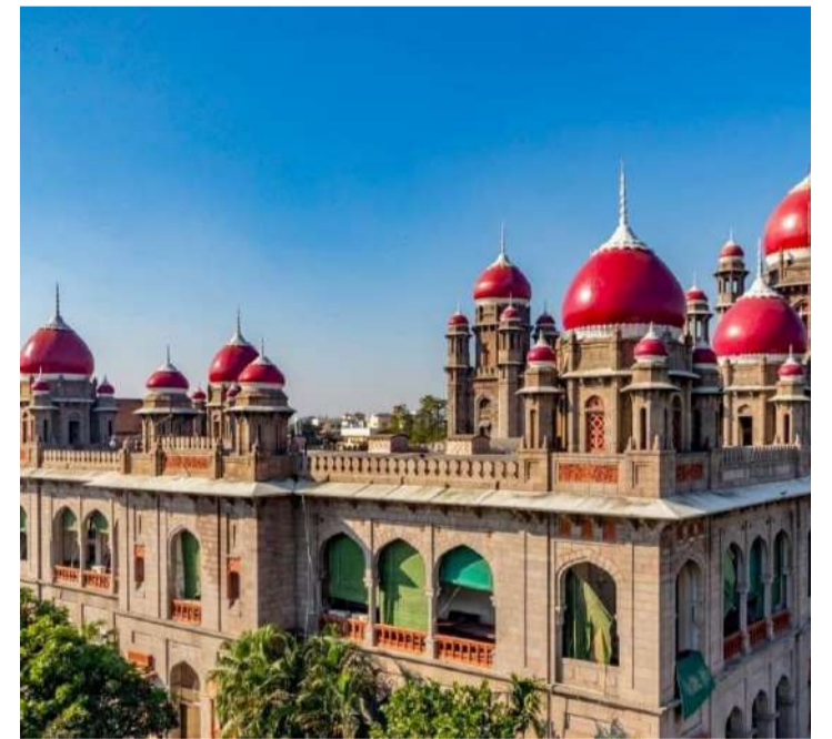
Hyderabad, March 22 | TPN Bureau

The Telangana High Court has temporarily halted the road widening work planned for Banjara Hills to the Jubilee Hills check-post after a petition challenged the land acquisition process undertaken by the Greater Hyderabad Municipal Corporation (GHMC). The court observed that proper procedures were not followed during the acquisition and ordered the state government and GHMC to suspend all further actions until the matter is resolved.