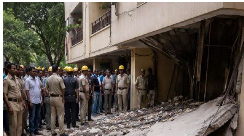
Hyderabad, March 22

A tragic accident in Begumpet, Hyderabad, on Sunday claimed the lives of two electricians and left the apartment owner critically injured after a balcony slab collapsed unexpectedly. The incident occurred at a third-floor flat in Methodist Colony, Kundan Bagh, under the jurisdiction of Panjagutta Police Station.