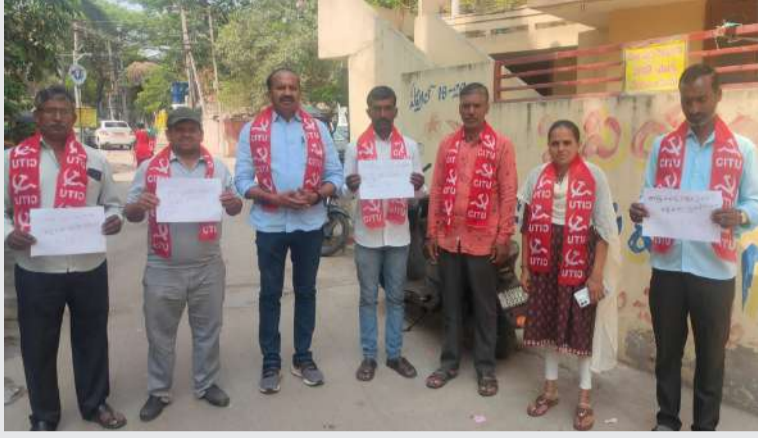
Quthbullapur, March 22 | TPN Bureau

The Centre of Indian Trade Unions (CITU) organized a protest in Shapoor Nagar on Sunday, criticizing the state government's latest budget for failing to adequately address the welfare of the poor, laborers, and other vulnerable groups. The demonstration highlighted concerns over insufficient allocations for key social welfare schemes and rising hardships faced by marginalized communities.