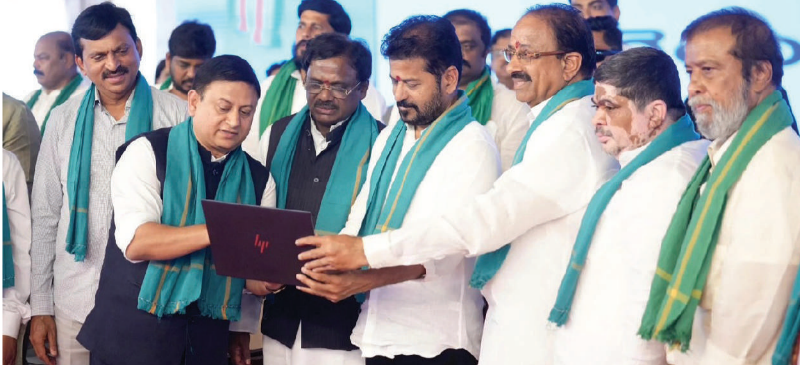
Hyderabad, March 22 | TPN Bureau

Telangana Chief Minister A. Revanth Reddy on Sunday released a major tranche of Rythu Bharosa funds for farmers across the state, reaffirming his government's commitment to agricultural welfare and financial security for cultivators. The announcement came amid the ongoing Rythu Utsvalu celebrations and marks a significant milestone in the state's farmer support programme.