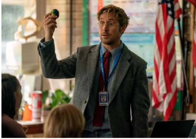
rise in collections.

Strong word of mouth and repeat viewership, particularly in premium formats, have driven its steady