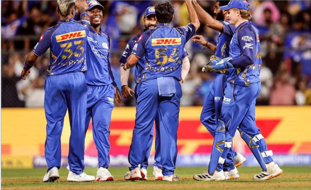
Mumbai Indians' strong start and highlighted the importance of the team effort in achieving the milestone victory. Rohit Sharma's aggressive knock set the tone early in the chase, while Shardul Thakur played a key role in restricting

Following the win, Tendulkar took to social media to praise the performances, applauding Rohit's attacking approach and Shardul Thakur's crucial contribution with the ball. His message celebrated