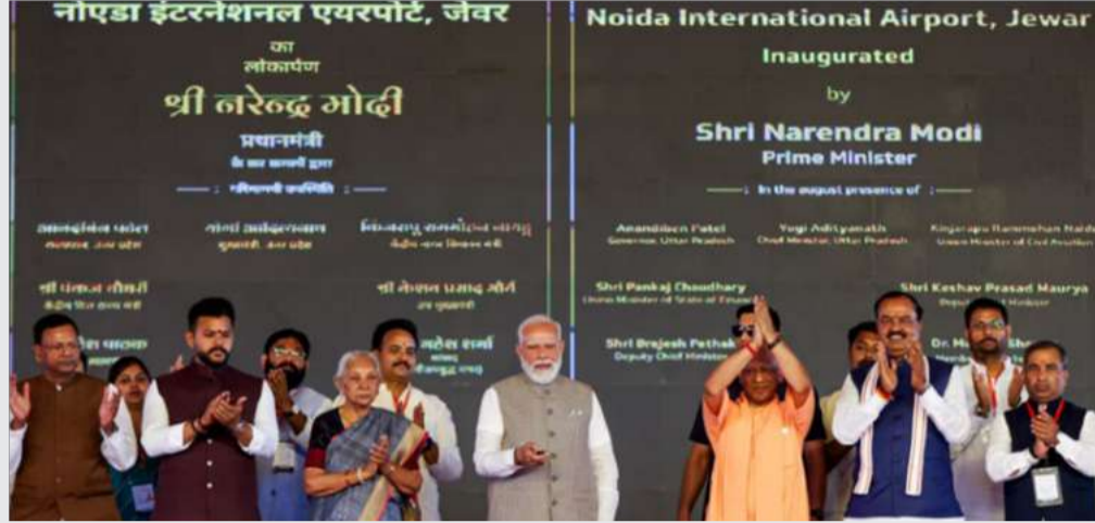
The development also carries strong economic implications for the region. Apart from creating direct employment opportunities in aviation and airport services, the airport is expected to spur growth in hospitality, logistics, retail, and allied sectors. The surrounding areas are likely to witness a surge in commercial and residential investments, contributing to overall urban development.

significantly decongest Indira Gandhi International Airport and boost air travel capacity. Today's inauguration marks the first phase of operations, allowing commercial flights to begin soon. Officials expect the airport to attract both domestic and international carriers, facilitating travel for millions of passengers annually. The new facility is anticipated to serve as a major aviation hub in northern India, enhancing connectivity across the country and abroad. Construction of the airport has been strategically planned with state-of-the-art infrastructure, including modern terminals, cargo facilities, and advanced passenger services. The project has been completed in phases, with the initial phase focusing on operational readiness, safety protocols, and passenger amenities.