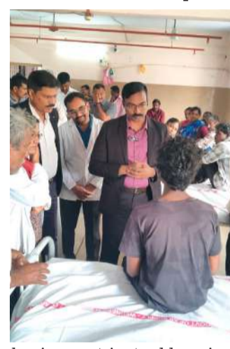
phasizes not just addressing the symptoms of crime, but tackling its root causes. His ability to listen, empathize, and implement a sustainable solution underscores the essence of people-centric policing.

This intervention stands out not merely as an administrative action, but as a reflection of visionary leadership. IGP Ravikrishna's approach em-