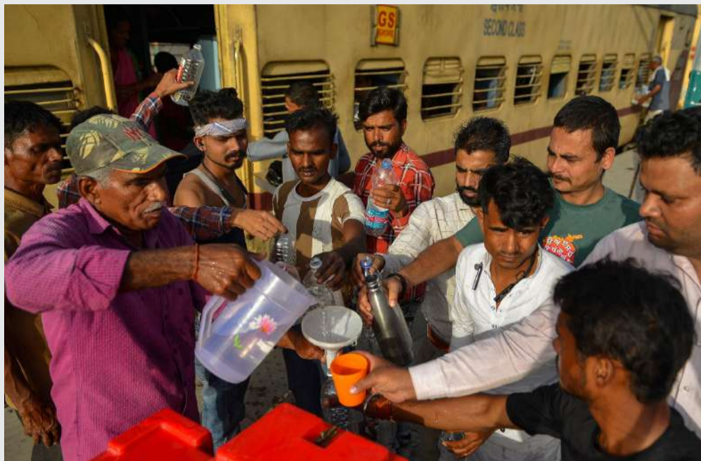
Guides, have been deployed to assist in the distribution of drinking water, ensuring passengers remain hydrated and

In addition, the division has made special arrangements to provide free drinking water, especially for passengers traveling in general coaches. These facilities are being set up at platform ends in key stations such as Visakhapatnam, Vizianagaram, Srikakulam Road, Duvvada, Rayagada, Koraput, and Jagdalpur. Civil Defence personnel, along with Scouts and