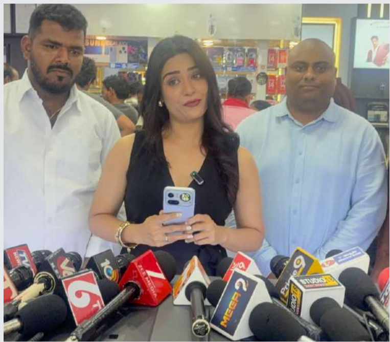
Mallapur, March 24 | TPN Bureau

A new addition to the smartphone market was unveiled in Mallapur as the Nothing R mobile phone was officially launched at Ravi Communication mobile store. The launch event was held with much enthusiasm, drawing the attention of local tech enthusiasts and customers.