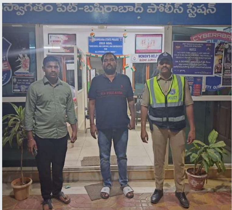
Quthbullapur, March 24 | TPN Bureau

Tension prevailed in Kompally after police detained a BRS student wing leader ahead of a planned Assembly protest. The action came in response to a call given by the BRSV (Bharat Rashtra Samithi Vidyarthi Vibhagam) for an Assembly march, demanding the implementation of promises made to students during elections.