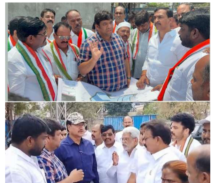
Nacharam, March 24

The HMT Nagar lake in Nacharam is set to undergo major development as part of the state government's lake rejuvenation initiative. Authorities recently sanctioned ₹30 crore for the beautification and restoration of the lake.