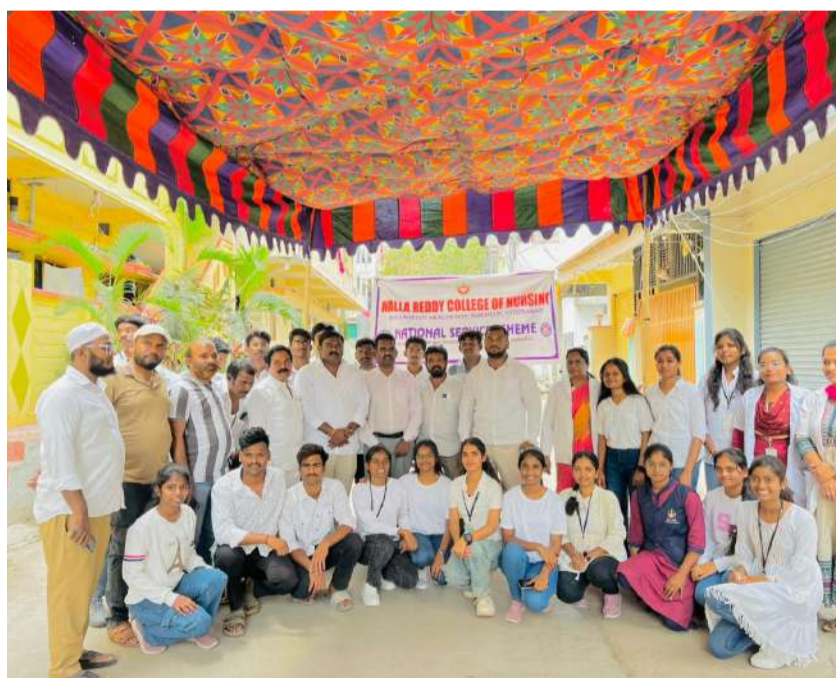
Quthbullapur, March 24