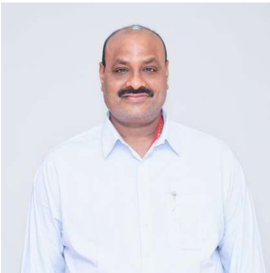
YSRCP government for politicizing the Skill Development initiative, which was launched to

est development clearly reinforces that he is a leader who stands firmly on the side of justice, fairness, and righteousness.” The minister highlighted that the ED’s finding of no involvement on the part of the Chief Minister is a matter of pride for both the leadership and the state. “Despite facing politically motivated scrutiny and multiple conspiracies by the previous government, CM Chandrababu maintained his composure and respect for the law at every step,” he remarked. Atchannaidu strongly criticized the previous