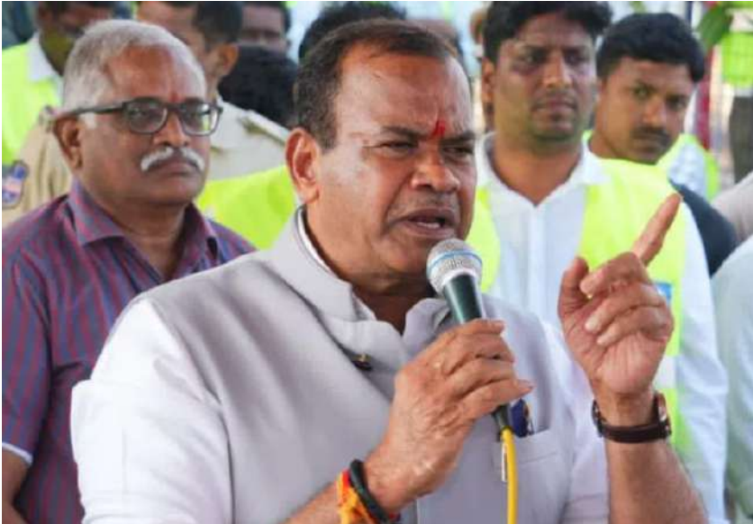
Assembly and the public. The role of Cinematography Minister Komatireddy Venkat Reddy came under particular criticism. The BRS said it was unfortunate that a minister had to publicly disown decisions taken by his own department. According

actually controlling governance in Telangana. The opposition party also recalled Chief Minister A. Revanth Reddy’s statements made on the floor of the Assembly, where he had categorically assured that there would be no increase in cinema ticket prices, no benefit shows, and no special privileges for anyone during his tenure. “Despite these assurances, ticket prices for at least three films have already been increased through overnight GOs, and preparations are reportedly underway to issue similar permissions for another film,” the statement alleged. The BRS accused the government of misleading both the