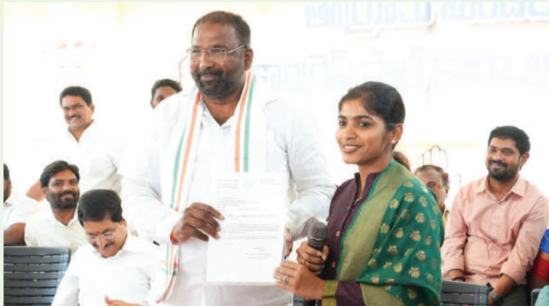
Palakurthi (Mahabubabad District), January 24

this momentum must be carried forward at the local body level as well,” he said.