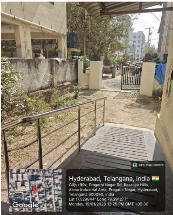
Basti Dawakhana. Acting swiftly, they ensured

ly to senior citizens, women, and patients seeking medical attention. Members of the voluntary organization “For a Better Society” brought this matter to the notice of True Point Media, highlighting the negligence and its impact on public health services. Taking immediate note of the issue, True Point News published a detailed report emphasizing the hardships faced by local residents and patients. Following the publication of the news report, officials from the Nizampet Circle Municipal Department responded promptly. The municipal authorities inspected the site and held discussions with the owner responsible for the construction work adjacent to the