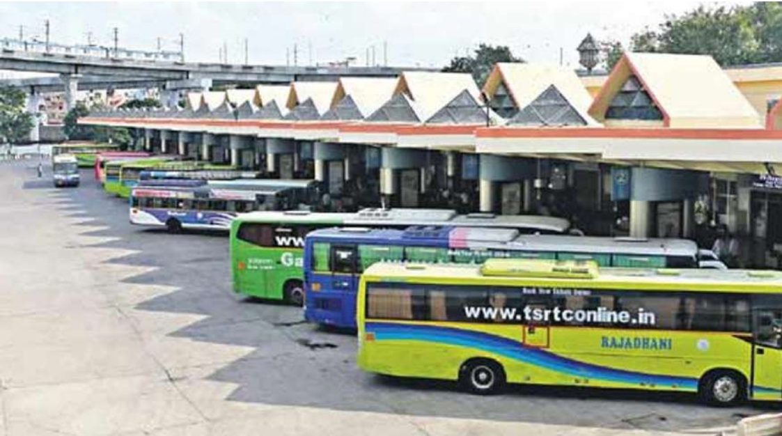
TSRTC buses are deployed for special services during the Sankranti festival. The image shows a line of green and yellow TSRTC buses parked at a station. A banner on the side of one of the buses reads 'www.tsrctonline.in' and 'RAJADHANI'. The background shows a cityscape with buildings and trees.