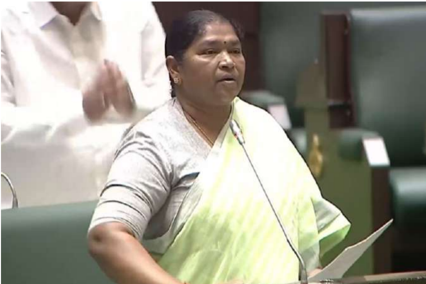
Girls above 15 years of age, elderly women, and even differently-abled women are being brought into SHGs, with special groups formed for ado-