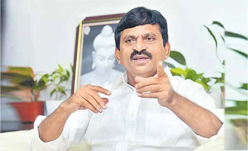
said the government aims to eliminate long waiting hours under