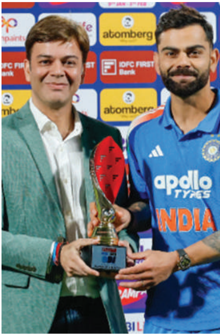
Most Player of the Match Awards in International Cricket