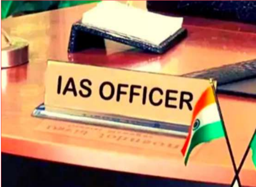
forcement coordination. Chief Minister N. Chandrababu Naidu’s admin-