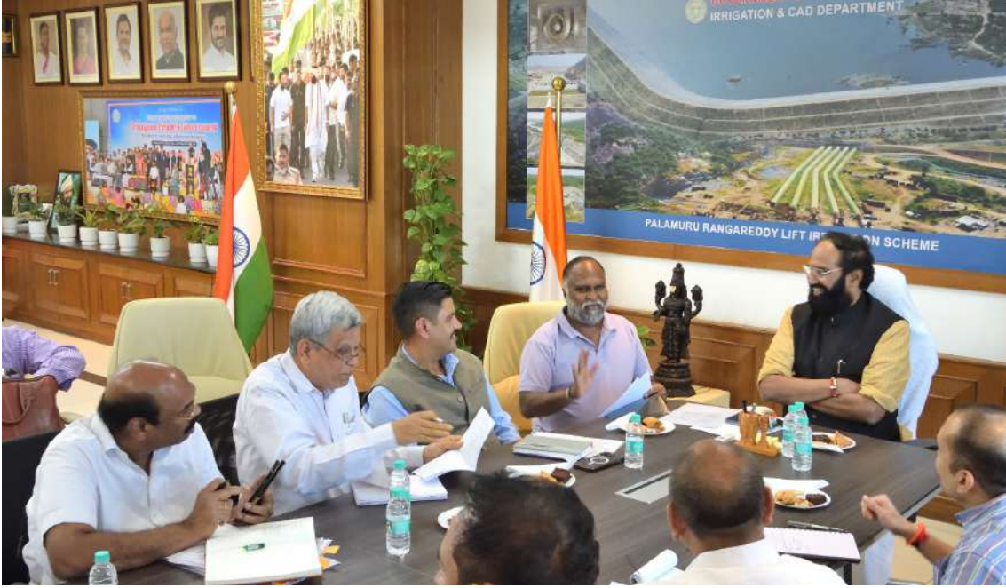
18 tanks in Sangareddy Mandal will receive 9.15 crores for renovation. Kandi Mandal's 15 tanks will be repaired at a cost of 8.07 crores, and 4 tanks in Kondapur Mandal will be allocated 4.16

Sangareddy, December 18: Water Resources and Civil Supplies Minister Uttam Kumar Reddy, in the presence of MLA Jaggareddy, directed officials to prepare proposals within three days for the modernization of the 15-kilometer-long Gangakathav Canal in Sadashivpeta and for the repair and construction of check dams in four mandals of the Sangareddy constituency. The total estimated cost for these initiatives is 101 crores. According to the detailed plan, 37 crores have been allocated for the modernization of the 15-kilometer Gangakathav Canal. Repairs for 30 tanks in Sadashivpeta Mandal are estimated at 10.72 crores, while