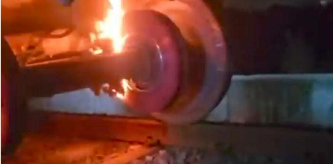
Officials emphasized that the quick action of the loco pilot and railway staff prevented

Mandal, Vikarabad district. On-site technical experts and railway personnel promptly responded, controlling the flames and preventing further escalation. Fortunately, no injuries were reported, allowing passengers to breathe a sigh of relief. Preliminary investigations suggest that the fire may have been caused by friction due to brake binding in the wheel assembly. The train remained stopped for approximately 30 minutes as safety checks were carried out before it was allowed to resume its journey.