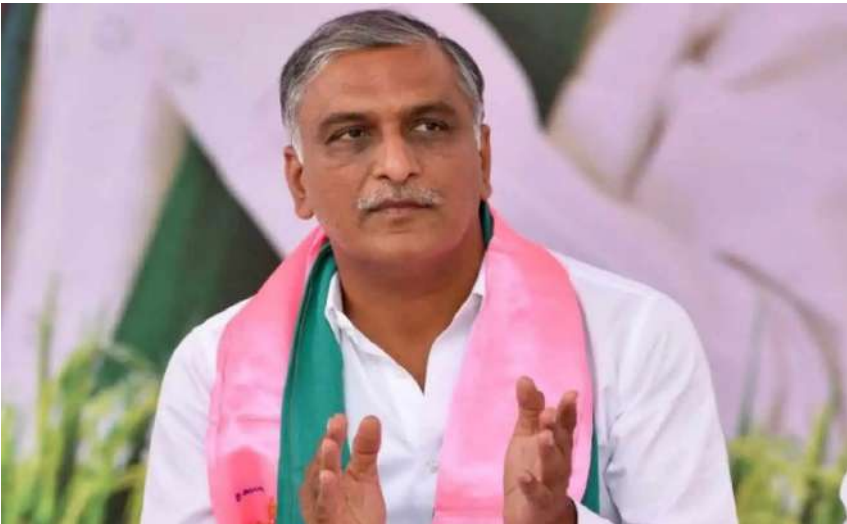
nakacherla issue and accused the Congress government of remaining inactive despite repeated warnings. Harish Rao alleged

The former minister questioned whether Revanth Reddy was acting as Telangana’s Chief Minister or paying “guru dakshina” to Chandrababu Naidu. He said BRS had first raised alarm over the Ba-