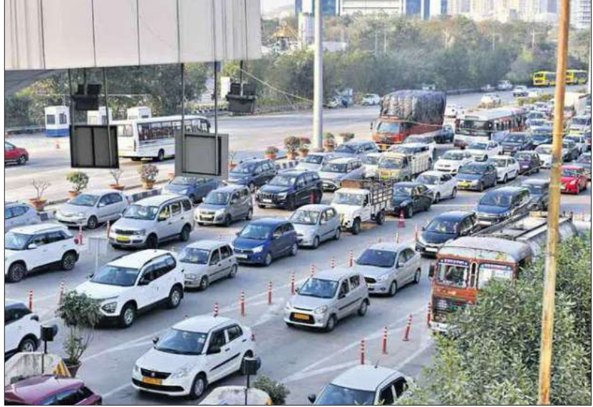
tives, and the impact on taxpayers.

As debate intensifies, political parties, civic groups, and commuters await further details on whether the toll free travel proposal will be approved and how it might be implemented if sanctioned.