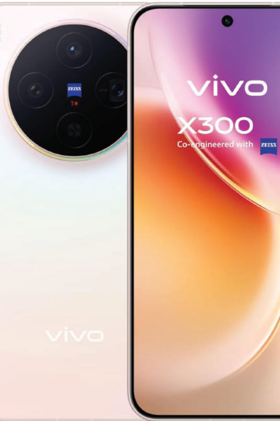
Smartphones no longer announce themselves with trumpets and teaser videos alone. Sometimes,

frameworks and influencing future policy standards. This alignment between corporate governance and public oversight could play a key role in shaping how economic value from AI is distributed globally. Ultimately, OpenAI's high-profile hiring decision reflects a deeper economic reality: as artificial intelligence becomes embedded in everyday economic activity, the cost of safety is becoming inseparable from the cost of innovation.