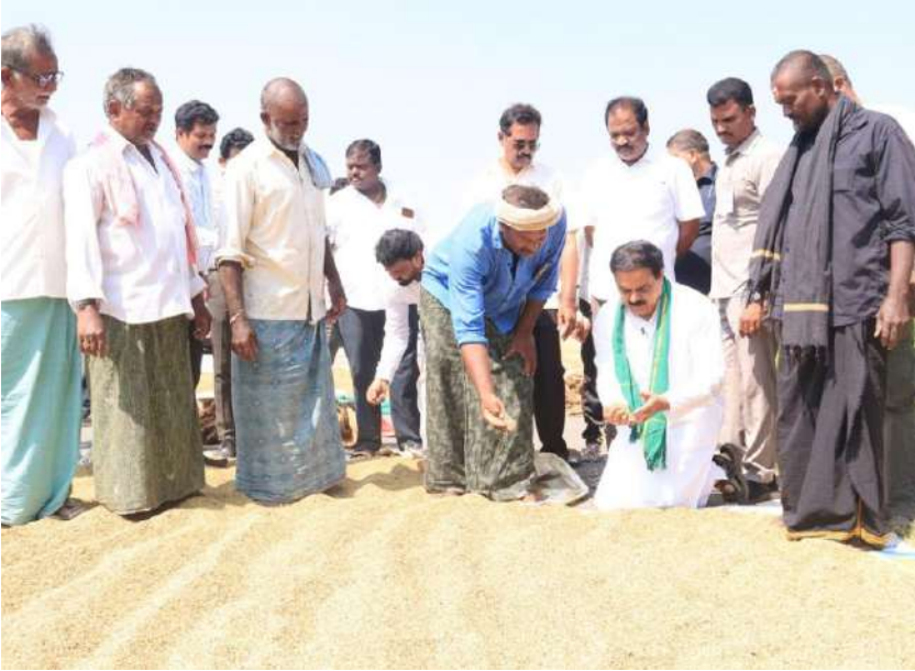
ment figures this season. He called upon officials of the Civil Supplies Department and other agencies to maintain momentum and ensure that the state meets its procurement target by Pongal.