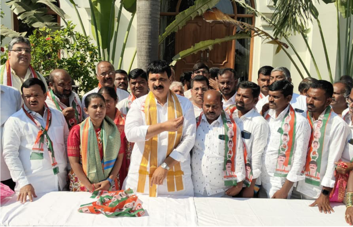
the BRS on several key issues, most prominently the delay in ration card distribution, stating,