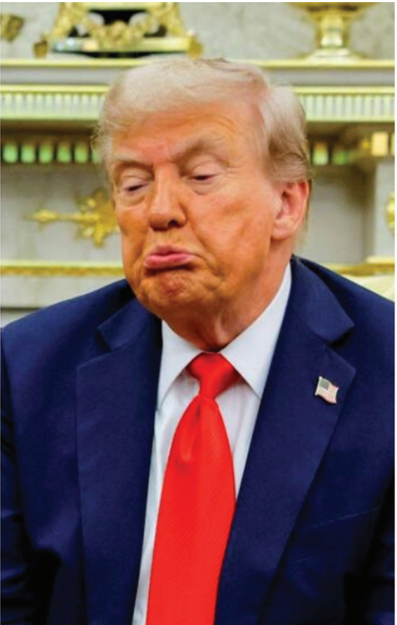
TPN Bureau, New Delhi

Russian President Vladimir Putin’s two-day visit to India has been widely interpreted as a powerful geopolitical signal, demonstrating that both Russia and India remain resilient to Western pressure. Chinese state media, in particular, has framed the visit as a “clear message” to the world that neither country is isolated, even as the United States and its allies encourage New Delhi to reduce economic engagement with Moscow.