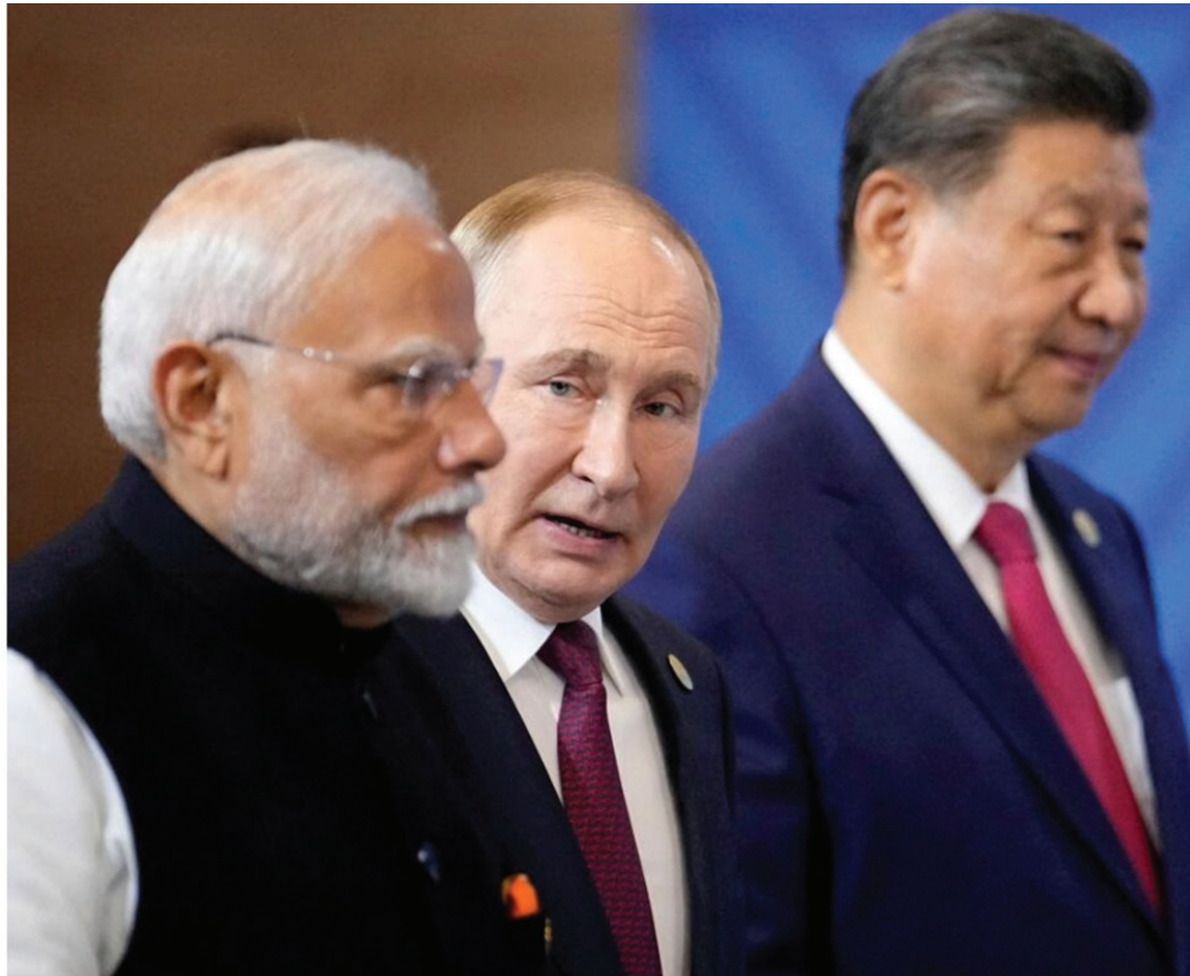
TPN Bureau, New Delhi

Russian President Vladimir Putin’s two-day visit to India has been widely interpreted as a powerful geopolitical signal, demonstrating that both Russia and India remain resilient to Western pressure. Chinese state media, in particular, has framed the visit as a “clear message” to the world that neither country is isolated, even as the United States and its allies encourage New Delhi to reduce economic engagement with Moscow.