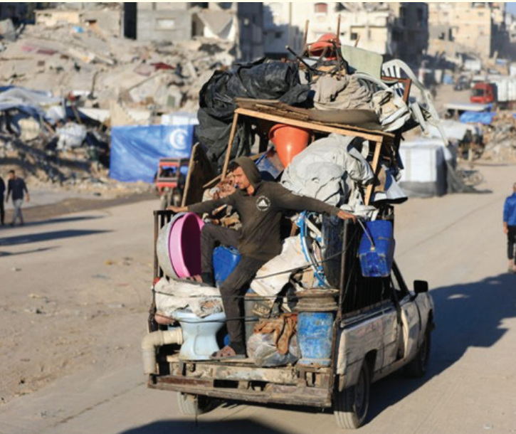
TPN Correspondent | Jerusalem

Israel on Wednesday announced that the remains returned from Gaza on Tuesday do not match any of the hostages killed during Hamas’ 2023 attack, according to a statement from the Prime Minister’s Office. Forensic testing confirmed that the materials handed over by Palestinian militants were unrelated to the 26 hostages who had died in captivity.