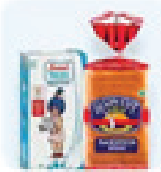
Dairy, Bread & Eggs