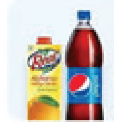
Cold Drinks & Juices