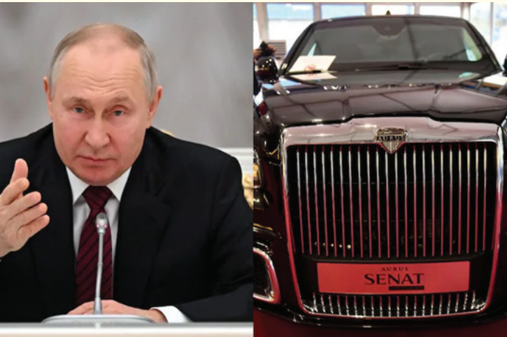
TPN Correspondent New Delhi

Russian President Vladimir Putin is set to arrive in India tomorrow for a two-day visit, and authorities have established an elaborate five-layer security ring to ensure his safety throughout the action-packed itinerary. The measures include top commandos, snipers, drones, jammers, AI monitoring, and facial recognition systems, according to sources.