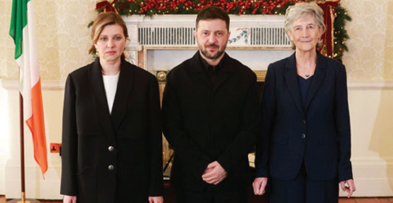
TPN Correspondent - Colombo

As peace efforts in the four-year-long Ukraine conflict gather momentum, US special envoy Steve Witkoff met Russian President Vladimir Putin in Moscow on Tuesday to discuss an early-stage peace plan, with hopes of ending the war. The