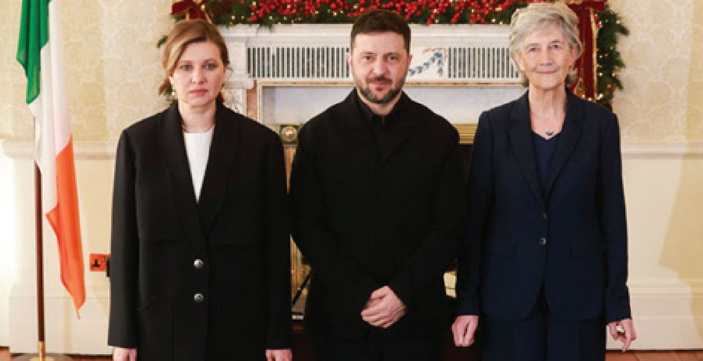
TPN Correspondent - Colombo

As peace efforts in the four-year-long Ukraine conflict gather momentum, US special envoy Steve Witkoff met Russian President Vladimir Putin in Moscow on Tuesday to discuss an early-stage peace plan, with hopes of ending the war. The