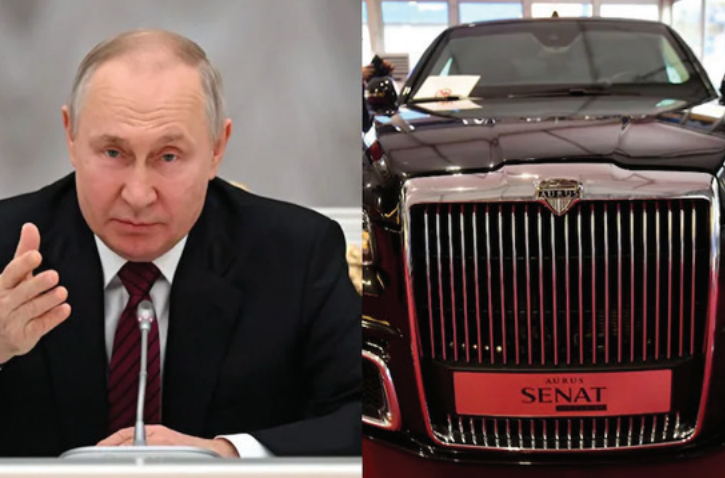
TPN Correspondent New Delhi

Russian President Vladimir Putin is set to arrive in India tomorrow for a two-day visit, and authorities have established an elaborate five-layer security ring to ensure his safety throughout the action-packed itinerary. The measures include top commandos, snipers, drones, jammers, AI monitoring, and facial recognition systems, according to sources.