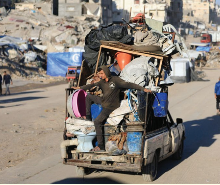
TPN Correspondent | Jerusalem

Israel on Wednesday announced that the remains returned from Gaza on Tuesday do not match any of the hostages killed during Hamas’ 2023 attack, according to a statement from the Prime Minister’s Office. Forensic testing confirmed that the materials handed over by Palestinian militants were unrelated to the 26 hostages who had died in captivity.