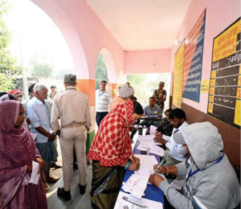
TPN Correspondent | Patna

Bihar witnessed a strong voter turnout in the second and final phase of its 2025 Assembly elections, with 60.4% of 3.7 crore voters casting their ballots across 122 constituencies till 3 pm, according to the Election Commission. The high turnout indicates an active engagement of the electorate in what is widely seen as a referendum on Chief Minister Nitish Kumar’s long tenure.