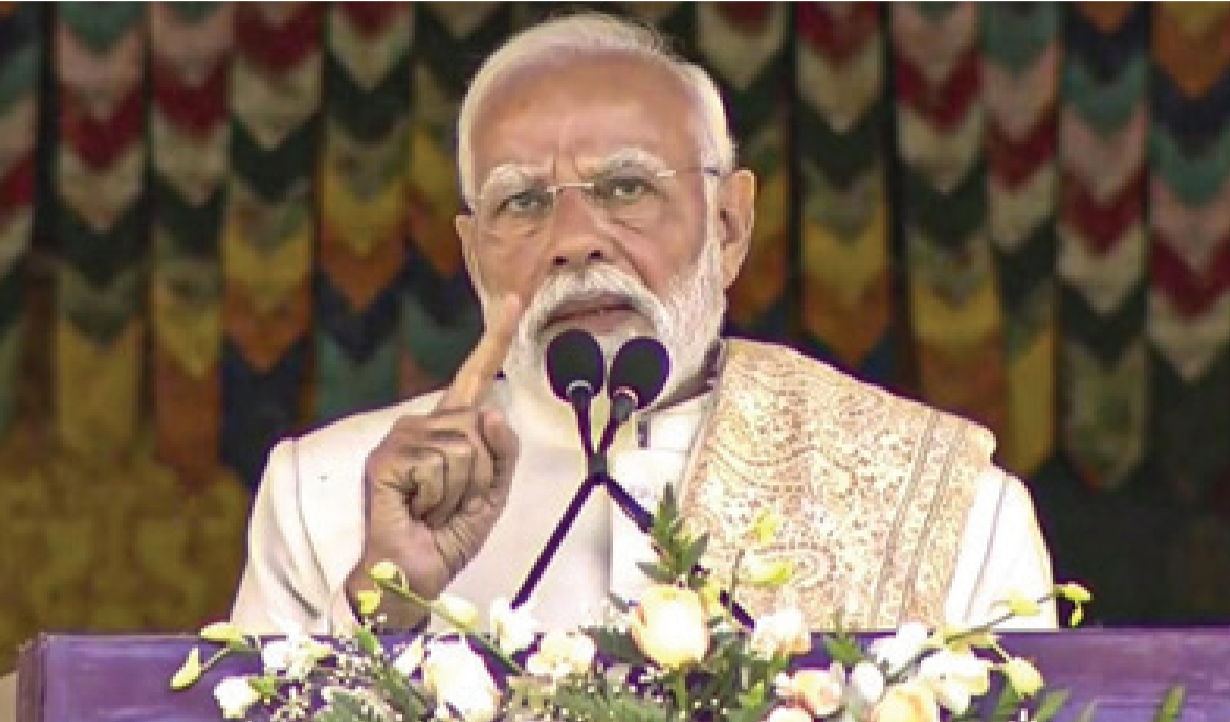
TPN Correspondent | Varanasi

Prime Minister Narendra Modi on Tuesday vowed that all those responsible for the deadly Delhi blast that claimed 12 lives will be brought to justice. Speaking at the Changlimithang celebration ground in Bhutan, Modi described the incident as “horrific” and said it had shocked the en-