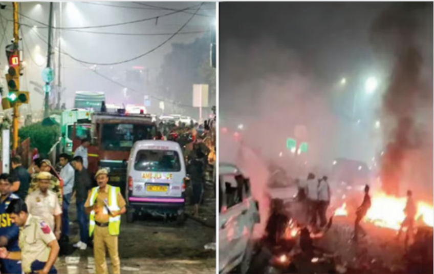
TPN Correspondent | Delhi

Nine people were killed and 20 injured after a high-intensity blast near Delhi’s historic Red Fort on Monday evening. The explosion ripped through a white Hyundai i20 at 6:52 pm near the Red Fort Metro Station, leaving mangled bodies and wrecked vehicles across the busy area.