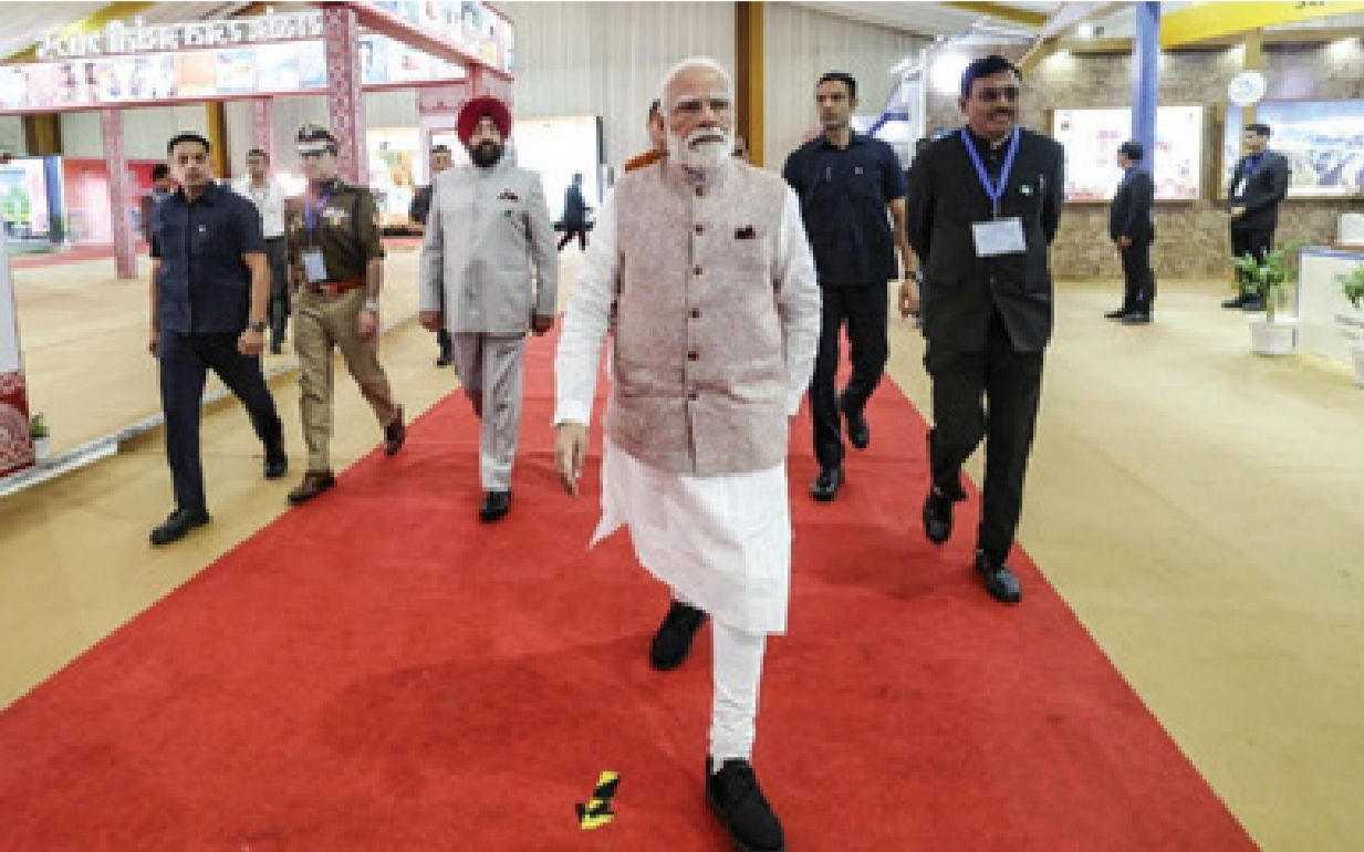
TPN Correspondent | Varanasi

Prime Minister Narendra Modi on Sunday inaugurated and laid the foundation stone for multiple development projects worth ₹8,260 crore in Uttarakhand, marking the 25th anniversary of the hill state's formation. The event, held in Dehradun,