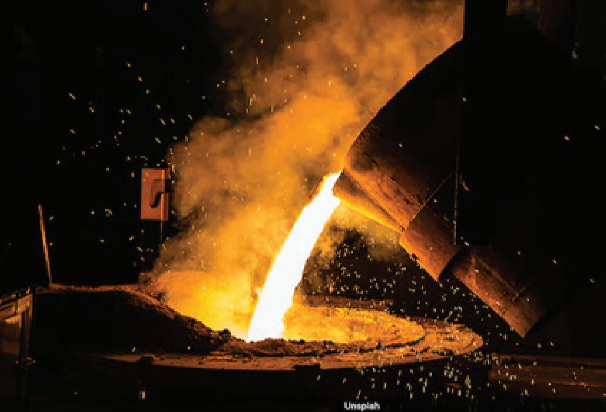
chemical and microscopic analysis of the materials, particularly slag, a byproduct of smelting. Published in the Journal of Archaeological Science, the study supports a long-held theory that the use of iron may have emerged accidentally, rather than through intentional in-

Patients are routinely instructed not to eat or drink anything for several hours before surgery — and this guideline isn't just hospital protocol, it's a critical safety measure rooted in medical science. According to experts, pre-surgery fasting — known medically as nil per os (NPO), meaning “nothing by mouth” — is vital to reduce the risk of aspiration during anaesthesia. When a person is under general anaesthesia, their reflexes, including the gag and cough reflex, are temporarily suppressed. If there is any food or liquid in the stomach, there's a chance it can travel back up the oesophagus and enter the lungs, leading to serious complications such as aspiration pneumonia. “Even a small amount of food or fluid in the stomach can be dangerous,” said a senior anaesthesiologist from AIIMS, New Delhi. “The stomach doesn't empty immediately after eating — digestion takes time. If the stomach isn't empty during surgery, it poses a significant risk.” What are the standard fasting guidelines? Typically, patients are advised to: