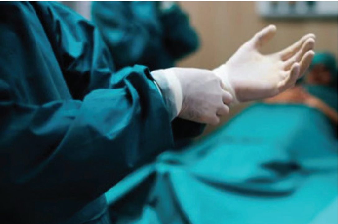
ing guidelines? Typically, patients are advised to:

Patients are routinely instructed not to eat or drink anything for several hours before surgery — and this guideline isn't just hospital protocol, it's a critical safety measure rooted in medical science. According to experts, pre-surgery fasting — known medically as nil per os (NPO), meaning “nothing by mouth” — is vital to reduce the risk of aspiration during anaesthesia. When a person is under general anaesthesia, their reflexes, including the gag and cough reflex, are temporarily suppressed. If there is any food or liquid in the stomach, there's a chance it can travel back up the oesophagus and enter the lungs, leading to serious complications such as aspiration pneumonia. “Even a small amount of food or fluid in the stomach can be dangerous,” said a senior anaesthesiologist from AIIMS, New Delhi. “The stomach doesn't empty immediately after eating — digestion takes time. If the stomach isn't empty during surgery, it poses a significant risk.” What are the standard fasting guidelines? Typically, patients are advised to: