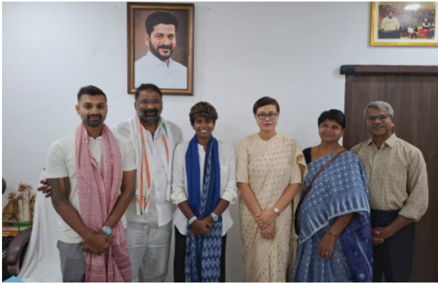
warmly at Shamshabad Airport. Later, the cricketer met Minister Sri-