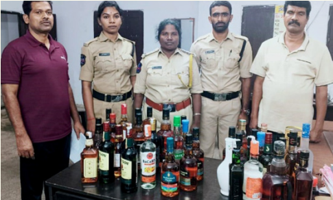
Saroornagar Excise Station for further investigation. The operation is part of the ongoing drive to curb illegal liquor transport in the region.

HYDERABAD | TPN BUREAU | Nov 7 Joint teams of the STF and C&D wings seized 43 liquor bottles during surprise checks near Pahadis-harif and along the Hyderabad-Srisailam highway. CIs Venkateshwarlu and Nagaraju confirmed that the seized bottles were handed over to the