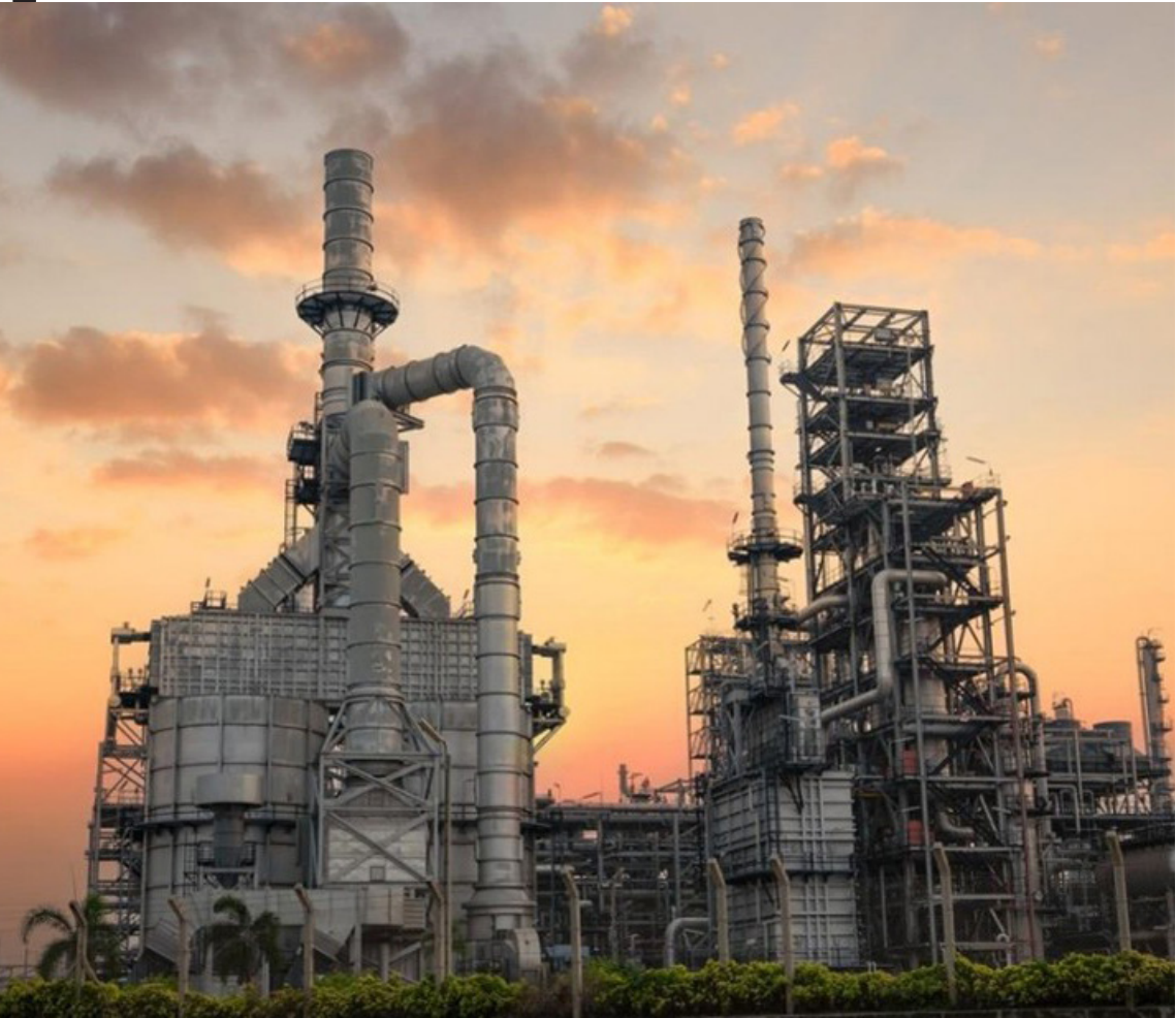
saw significantly slower growth, further dampening the overall index. Sectors like steel, ce-

Fertiliser output, while not contracting,