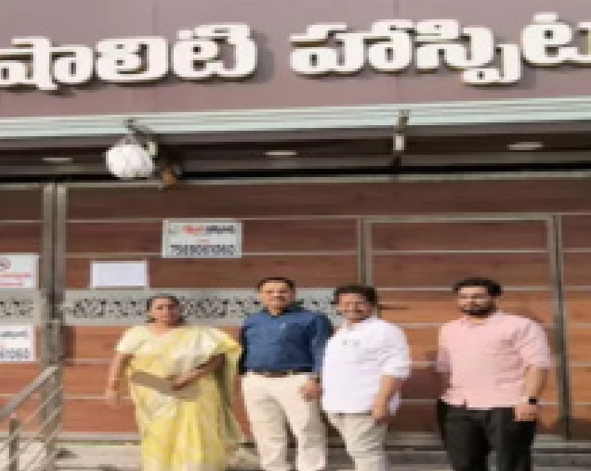
Medical staff, and possible external agents suspec-tive staff, and possible external agents suspect-ed of facilitating organ trade. The case has been booked under sections related to human organ