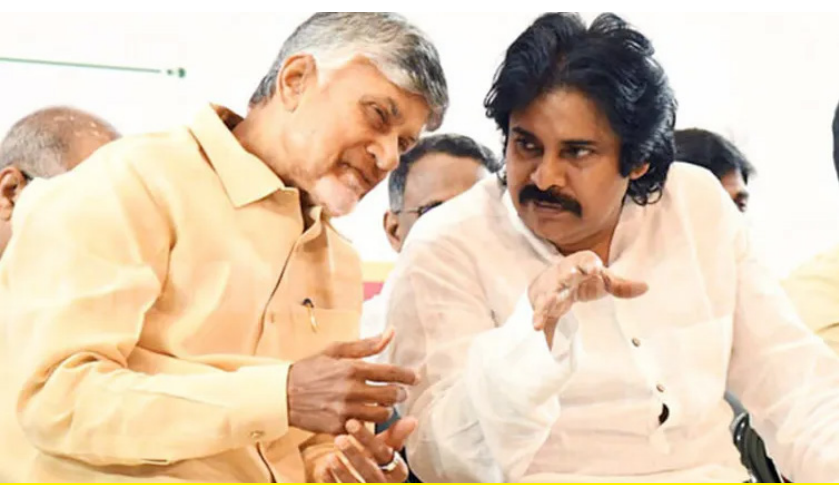
From the early days of the alliance government, Pawan Kalyan has displayed a keen eye for detail in monitoring the activities of both his party members and government departments.

Vijayawada: Andhra Pradesh Deputy Chief Minister and Jana Sena Party (JSP) chief Mr. Pawan Kalyan is steadily emerging as a decisive force within the state's alliance government. Once perceived by critics as politically passive or less informed about government functioning, recent developments have shown quite the opposite. His assertive participation in cabinet meetings, pointed remarks on governance lapses, and interventions in administrative issues are highlighting his growing influence in the coalition led by Chief Minister Mr. N. Chandrababu Naidu. From the early days of the alliance government, Pawan Kalyan has displayed a keen eye for detail in monitoring the activities of both his party members and government departments. During recent cabinet meetings, his pointed discussions about the behavior of certain MLAs and district-level administrative lapses drew attention across political circles. While he refrained from naming any legislator directly, his comments on MLAs' involvement in civil disputes indirectly hinted at corruption and misuse of power. Taking On Administrative Lapses One of Pawan Kalyan's first assertive moves