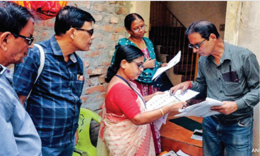
TPN Correspondent | Kolkata

The Election Commission of India (ECI) has received multiple complaints regarding Booth Level Officers (BLOs) in West Bengal distributing Special Intensive Revision (SIR) electoral forms at public places, sparking concern over procedural violations. Political parties have reported that BLOs handed out forms at tea stalls, local clubs, street corners, and schools, instead of visiting voters' homes as mandated. In some areas, people were seen rushing to streets to collect the forms directly from officers. The irregularities have reportedly left the state's Chief Electoral Officer (CEO) embarrassed. Following these complaints, the ECI issued a