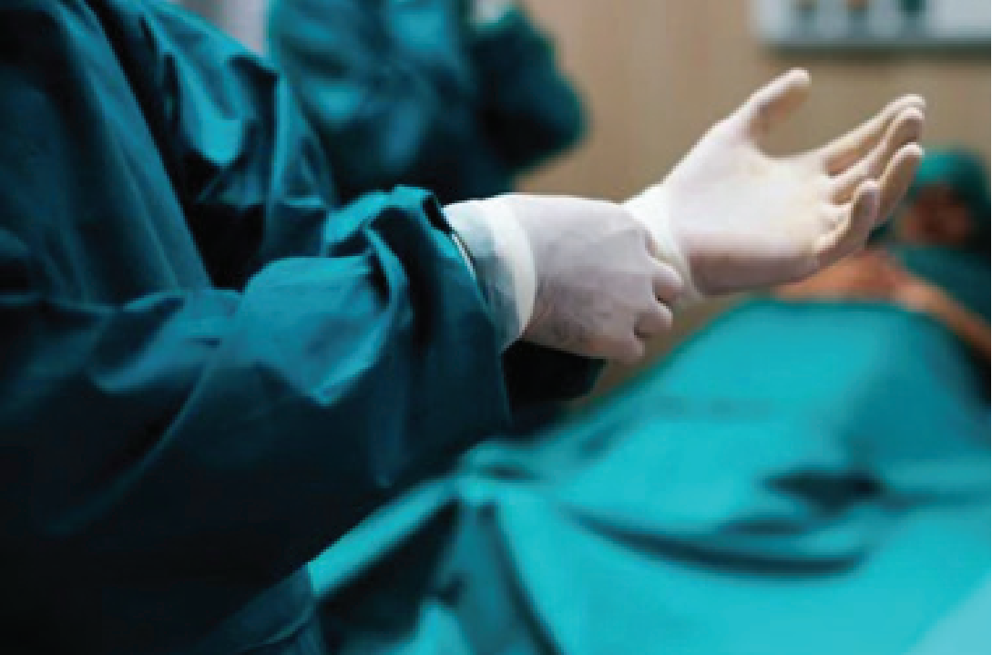
ing guidelines? Typically, patients are advised to:

Patients are routinely instructed not to eat or drink anything for several hours before surgery — and this guideline isn't just hospital protocol, it's a critical safety measure rooted in medical science. According to experts, pre-surgery fasting — known medically as nil per os (NPO), meaning “nothing by mouth” — is vital to reduce the risk of aspiration during anaesthesia. When a person is under general anaesthesia, their reflexes, including the gag and cough reflex, are temporarily suppressed. If there is any food or liquid in the stomach, there's a chance it can travel back up the oesophagus and enter the lungs, leading to serious complications such as aspiration pneumonia. “Even a small amount of food or fluid in the stomach can be dangerous,” said a senior anaesthesiologist from AIIMS, New Delhi. “The stomach doesn't empty immediately after eating — digestion takes time. If the stomach isn't empty during surgery, it poses a significant risk.” What are the standard fasting guidelines? Typically, patients are advised to: