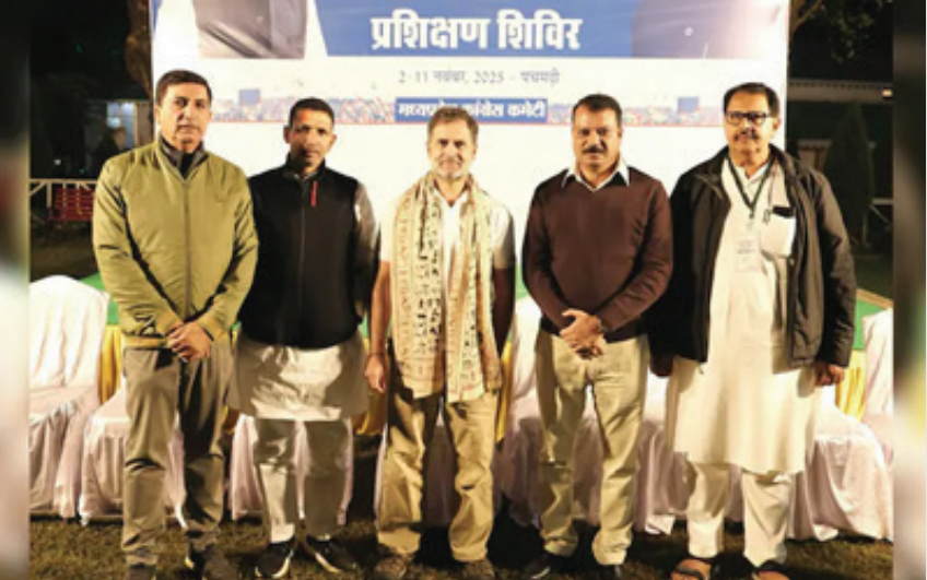
TPN Correspondent | Patna