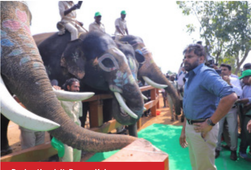
During the visit, Pawan Kalyan personally reviewed the progress of ongoing training sessions and interacted with forest officials, trainers, and mahouts. The camp currently houses seven trained Kunkie elephants — four recently inducted from Karnataka and three from the existing forest camp all undergoing specialized training aimed at controlling and guiding wild elephants in conflict zones.

Andhra Pradesh Deputy Chief Minister and Minister for Forest and Environment Pawan Kalyan on Sunday visited the newly developed Kunkie Elephant Training Centre at Musalamma du in the Palamaner constituency of Chittoor district. The centre has been established to train elephants brought from Karnataka for forest management and to help control wild herds that often stray into human settlements, damaging crops and creating panic among villagers. During the visit, Pawan Kalyan personally reviewed the progress of ongoing training sessions and interacted with forest officials, trainers, and mahouts. The camp currently houses seven trained Kunkie elephants — four recently inducted from Karnataka and three from the existing forest camp all undergoing specialized training aimed at controlling and guiding wild elephants in conflict zones. The Deputy Chief Minister attentively observed live demonstrations showcasing the elephants' abilities in forest tasks and conflict scenarios. Trainers illustrated how these