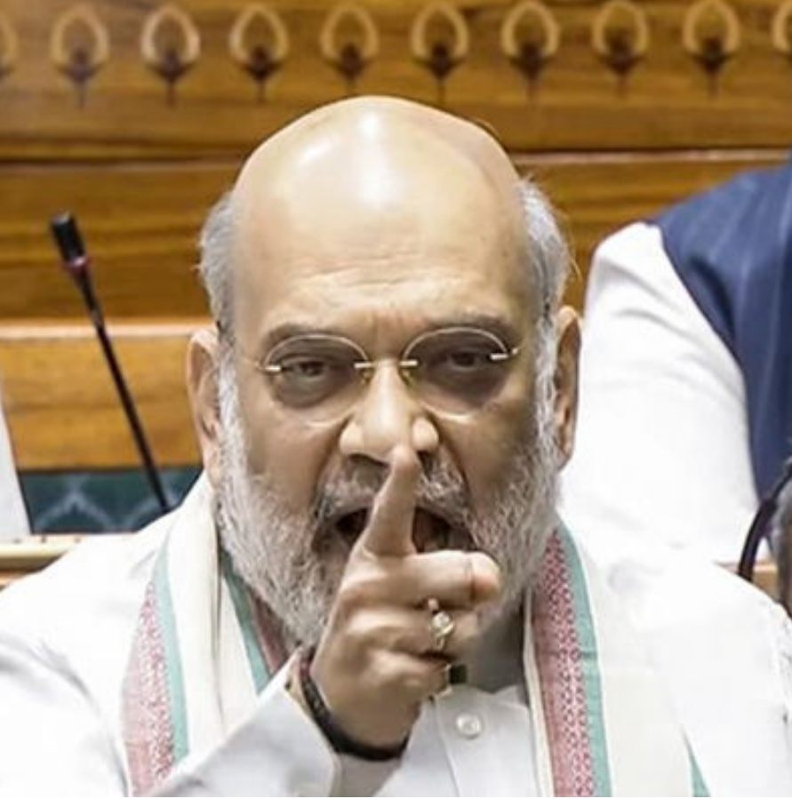
TPN | G. Avinash

Hyderabad: Amit Shah's record-breaking tenure as India's longest-serving Union Home Minister is not just a numerical achievement—it's a statement of continuity, decisiveness, and transformation in the country's internal security narrative. Surpassing stalwarts like Lal Krishna Advani and Govind Ballabh Pant, Shah's 2,258-day run (as of August 4, 2025) marks a critical shift in how the role of Home Minister is viewed in the broader arc of Indian governance. Coincidentally or symbolically, this milestone arrives on August 5, the same date in 2019 when Shah stood in Parliament and announced the abrogation of Article 370—arguably the most consequential move by a Home Minister in India's recent histo-