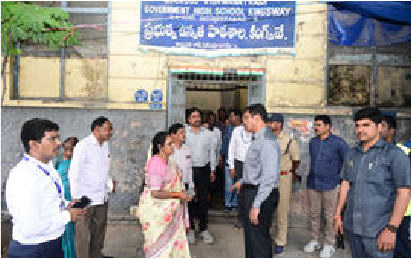
to expedite the construction of a new school building. He also instructed officials to plan demolition work during the upcoming holiday week to avoid academic disruption.