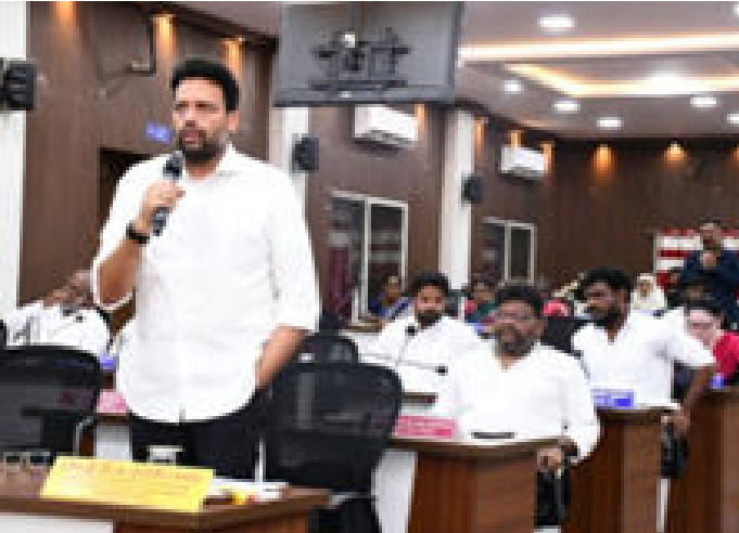
TPN Correspondent | Kurnool

In a strong call for non-political collaboration, Minister for Industries, Commerce, and Food Processing TG Bharat urged all stakeholders to work together for the holistic development of Kurnool city. Addressing a municipal general body meeting on Saturday at the SBI Employees Colony, chaired by Mayor B.Y. Ramayya, the minister stressed that urban development should transcend political boundaries. Panyam MLA Gouri Charitha Reddy and Municipal Commissioner P. Vishwanath were also present at the meeting. The body discussed 31 agenda items and gave the green signal for development works amounting to ₹29.58 crore. Among the issues discussed was the disruption in water supply caused by pipeline leakages in Santosh Nagar. Minister Bharat assured that the government is committed to resolving such long-pending civic concerns at the earliest. He appealed to all elected representatives, regardless of party affiliations, to cooperate and speed up developmental activities. “We must act beyond politics to bring comprehensive development to Kurnool,” he asserted. Despite the important deliberations, the meeting had to be adjourned due to unavoidable circumstances. The remaining discussions are expected to continue at a later date.