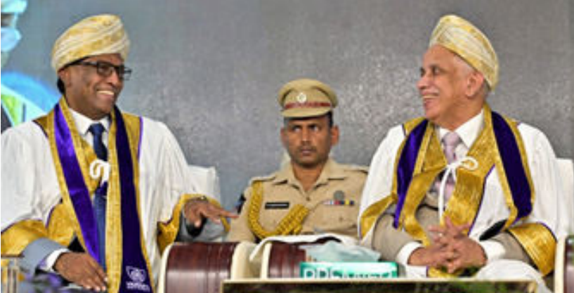
Highlighting the government's

Governor S. Abdul Nazeer said Amaravati is evolving as a technology-driven, knowledge-based city that embodies innovation, digital governance, and smart infrastructure. He made these remarks while addressing the 13th Convocation of Vignan's Foundation for Science, Technology & Research, a deemed-to-be university located at Vadlamudi in Guntur district, on Saturday.