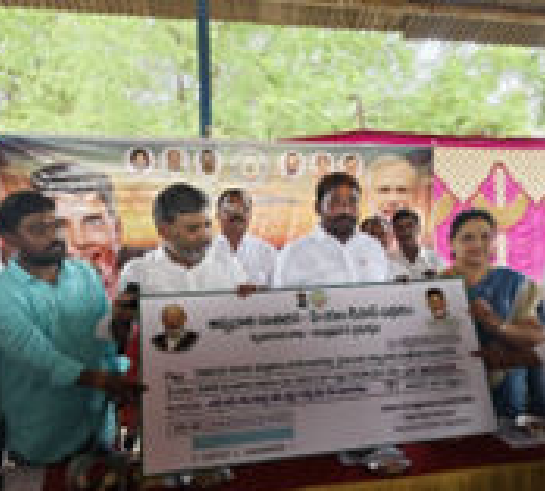
TPN Correspondent | Dharmavaram