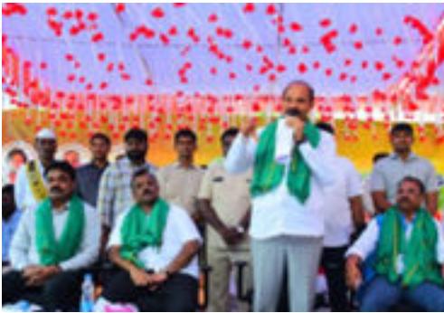
TPN Correspondent | Bapatla