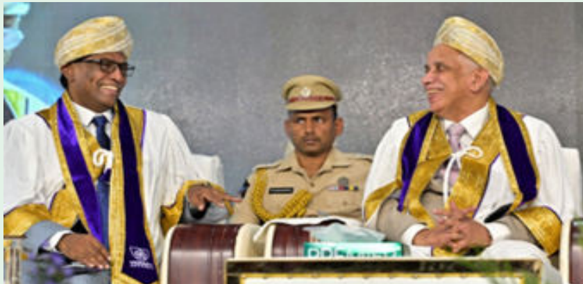
Amaravati Emerging as Tech and Knowledge Capital: Governor