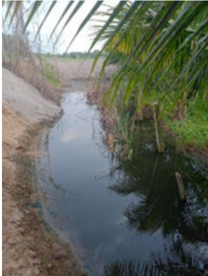
Irrigation dept confirms crop canal, but revenue officials deny its existence

East Godavari: The pictures above is not just a random patch of land. It’s the scene of a major revenue deception. What the irrigation department confirms as a crop canal, the revenue officials conveniently dismiss as non-existent. Welcome to Komatigunta village, Gopalapuram mandal — where water rights are buried under bureaucracy and backdoor deals. Local farmers are crying foul after an influential farmer allegedly encroached upon and covered a certified irrigation canal connected to the Avududa pond. The canal, crucial for irrigating downstream fields, has now vanished under a blanket of soil — and officials seem to be playing dumb. The Irrigation Department carried out a field inspection and clearly issued a certificate stating that it is, in fact, a crop canal. But shockingly, the Deputy Tahsildar of the Revenue Department is backing the encroacher, stating there is no canal at all. Farmers say this is a clear case of collusion and a betrayal of public trust. Frustrated farmers have made multiple complaints through the Public Grievance Redressal System (PGRS) at the Collectorate, only to be met with silence. Despite repeated pleas, officials continue to side with the encroacher, leaving the rightful owners high and dry — literally.