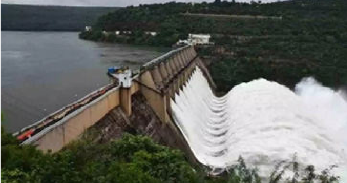
TPN Correspondent | Srisailam

The Srisailam reservoir is witnessing a steady rise in inflows as heavy floodwaters continue to enter from upstream projects. According to officials, a combined inflow of 1,98,550 cusecs is being received from the Jurala and Sunkesula projects. The current water level at the Srisailam dam stands at 880.40 feet, just 4.6 feet short of its Full Reservoir Level (FRL) of 885 feet. The reservoir, which has a total storage capacity of 215.80 TMC (thousand million cubic feet), has already reached 190.33 TMCs, indicating that it is rapidly nearing its full capacity. To manage the rising water levels, authorities have released an outflow of 59,239 cusecs. Of this, 35,315 cusecs are being discharged through the left bank hydroelectric power station, while 23,924 cusecs are being released via the right bank power station. The discharged water is being di-