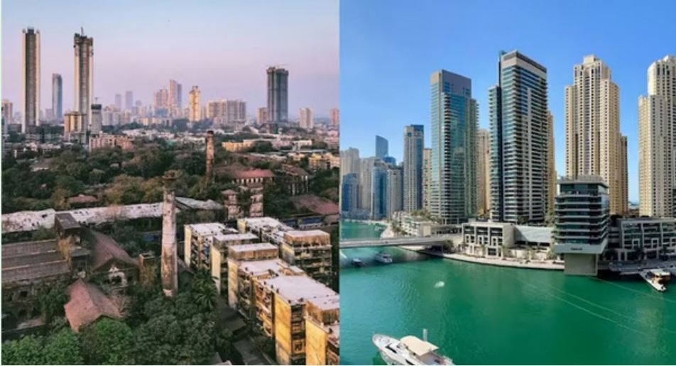
flurry of responses, reflecting public frustration with Mumbai’s increas-