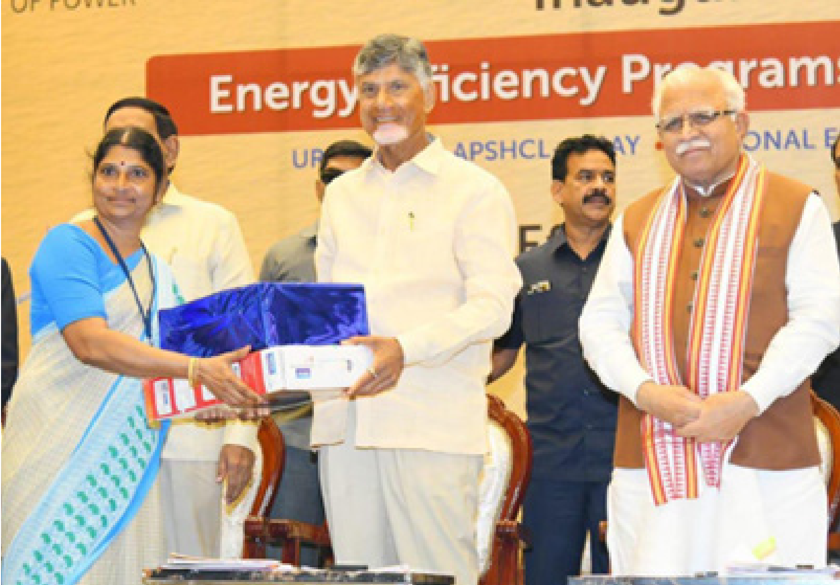
In the Presence of Union Minister for Housing, Energy & Urban development, GOI Shri Manohar Lal Khatter the Chief Minister of Andhra Pradesh Shri N. Chandra Babu Naidu is distributing Energy Efficiency Appliances to Beneficiary recently in Vijayawada. - File Photo.